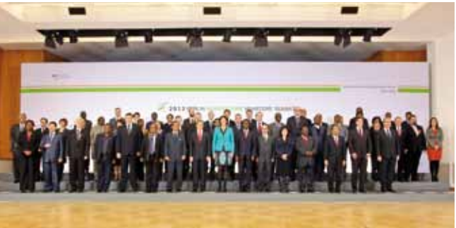
Participants of the Berlin Agriculture Ministers' Summit 2012

The 2013 GFFA, entitled “Responsible Investment in the Food and Agriculture Sectors – A Key Factor for Food Security and Rural Development”, will bring together politics, industry, academia and civil society at a forum for exchange and political understanding, providing a platform for intensive talks, discussions and meetings at the various events.