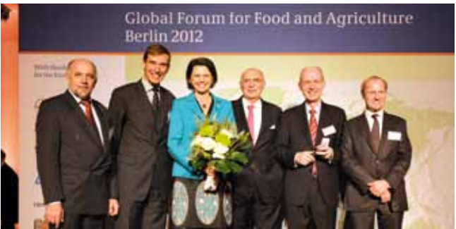
Federal Minister Ilse Aigner with the members of the GFFA Berlin e. V.