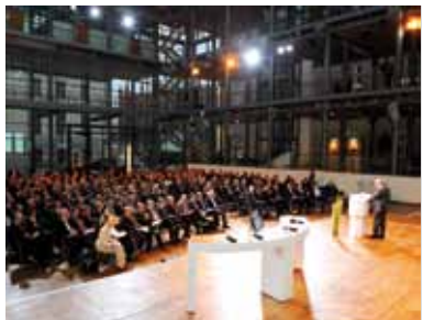
International Business Panel Discussion at the Deutsche Telekom Building

For further information please visit: www.gffa-berlin.com