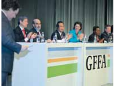
International Agriculture Ministers' Panel Discussion