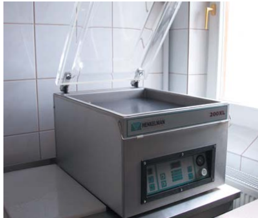
Figure 9: High tech small scale packing machine before loading and with the product ready to weigh and label

Roe products are a high value product made by separating individual eggs from each other and from skein material (screening), followed by brining in a saturated solution and curing (Bledsoe and Rasco, 2006). Screening can be done manually or using enzyme preparations rich in collagenase. After curing, roe is graded for instance according to flavor and colour, or even size. Roe is usually packed into plastic containers and frozen.