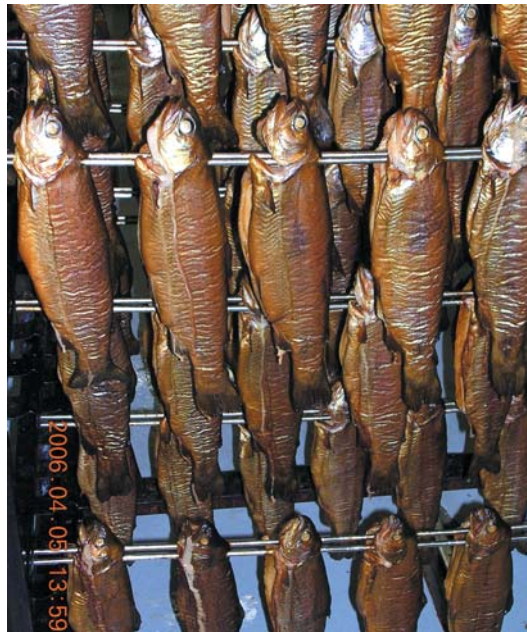
Figure 6: Cold smoked trout

These products have a shelf life of about 20–50 days when stored at 0–5 °C.