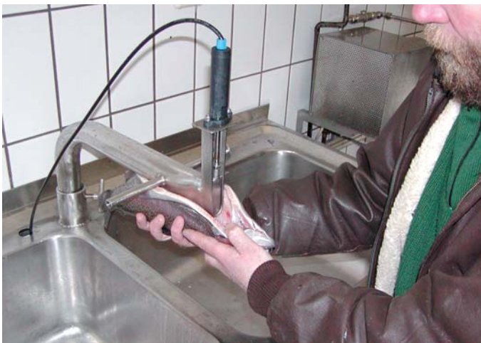
Figure 2: A simple but highly sufficient place to clean fish (above left). Knife to cut the belly and vacuum gutting device fixed together near to the wheel brush to clean the fish from inside (above right and left below)