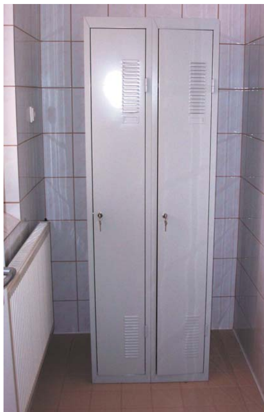
Figure 10: Personal hygiene of workers starts at the proper storing of their clothes

Providing safe food, free from contamination for human consumption, is important to ensure effective food control (Huss et al., 2005). Good Hygiene Practices (GHP) are all the practices regarding the conditions and measures necessary to ensure the safety and suitability of food at all stages of the food chain (CAC, 2001). In fish processing, it is important to maintain hygiene in order to maintain quality of fish. This is not only limited to the fish itself, but also covers the processing facility, processing equipment and the workers in the facility.