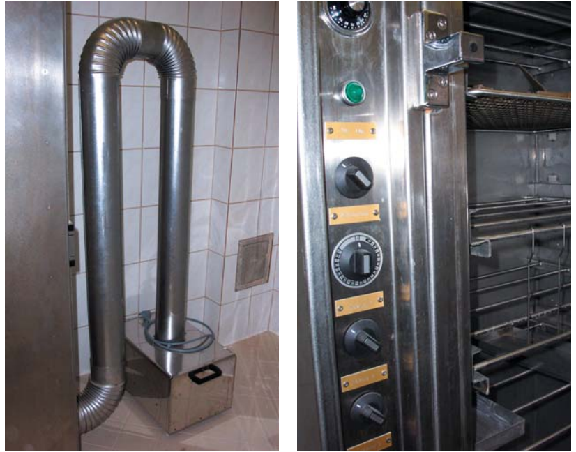
Figure 5: Small scale cold smoking apparatus

Warm smoking is at temperatures between 30 and 80 °C but it is typically done at temperatures between 30 and 60 °C. Depending on fish size and smoke quality, fish should remain 2–6 hours in the smoke.