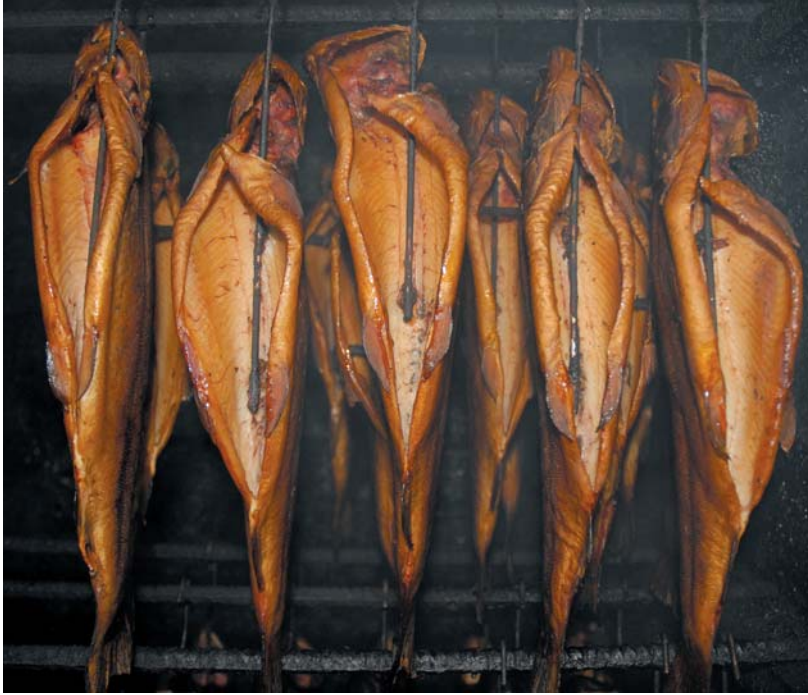
Figure 7: Trout smoked on wood

and Lawson, 1985). The liquid concentrate transfers the aroma and flavor of smoke onto the product. In some developing countries grass, coconut husks, saw dust and even cow dung have been used to generate smoke.