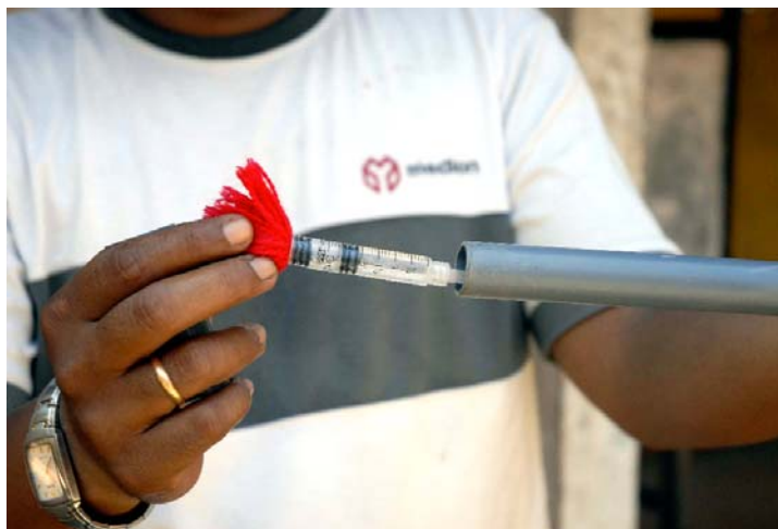
Fig. 3 The strychnine dart being prepared in Bali.

to deliver a deadly dose of strychnine ( Fig. 3 ). In several published papers, the Australian team was critical of the failure of the Indonesian government to bring an end to the Flores rabies outbreak. Yet the methods that were advanced in Bali were essentially the same as what had failed in Flores 8 years before [12, 13]. Limited vaccination was initially done only in the areas where rabies cases were known to have occurred. For most of 2009 the government vaccination effort used low potency vaccines of Indonesian manufacture which were believed to require revaccination after only six months, meaning that the entire vaccination campaign had to be continually repeated. Lack of coordination between the vaccination teams and dog poisoning teams made matters worse, as vaccinated dogs were frequently poisoned, leaving habitat open to unvaccinated dogs from areas with rabies. BAWA, from November 30, 2008 until approximately one year later, repeatedly attempted to obtain government permission to import three-year vaccines and do intensive dog vaccination, under a memorandum of understanding which would ensure that vaccinated dogs would not be killed in poisoning sweeps. Failing to secure the necessary memorandum of understanding with Balian provincial agencies, BAWA eventually began working at the regency level instead, vaccinated more than 80% of the dogs in Gianyar regency, and as of the beginning of June 2010 is moving to do likewise in Bangli regency.