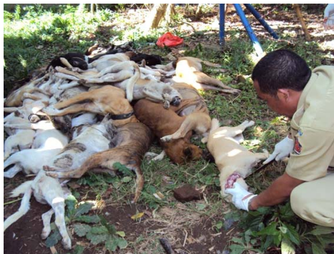
Fig. 2 A day's work culling dogs in Bali.

2008 and the first week of September, just on the opposite side of the Denpasar International Airport from where rabies had begun to spread, unchecked and unnoticed, through the isolated Balian southern peninsula. The Asia for Animals conference spotlighted the work of the Bali Street Dog Foundation, the Yudisthira Foundation, and the Bali Animal Welfare Association, who among them had sterilized more than 20,000 street dogs during the preceding decade, primarily in the densely populated tourist areas south and east of Denpasar, the Bali capital.