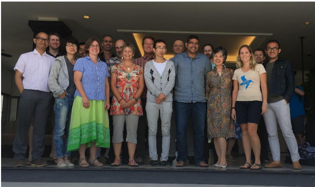
Figures 2a and b: Team photograph including all the participants from each workshop (a – Kruger National Park; b – Hoi An). Additional images are available on request.