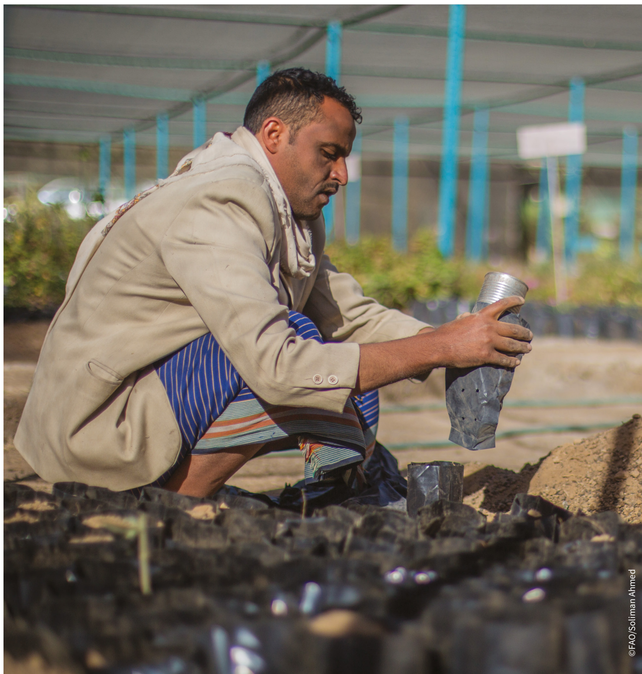
Photo: A farmer prepares seedlings for planting.

Investing in agricultural livelihood interventions will help food insecure households to produce much-needed and life-saving food, and reduce their dependency on food assistance and food imports.