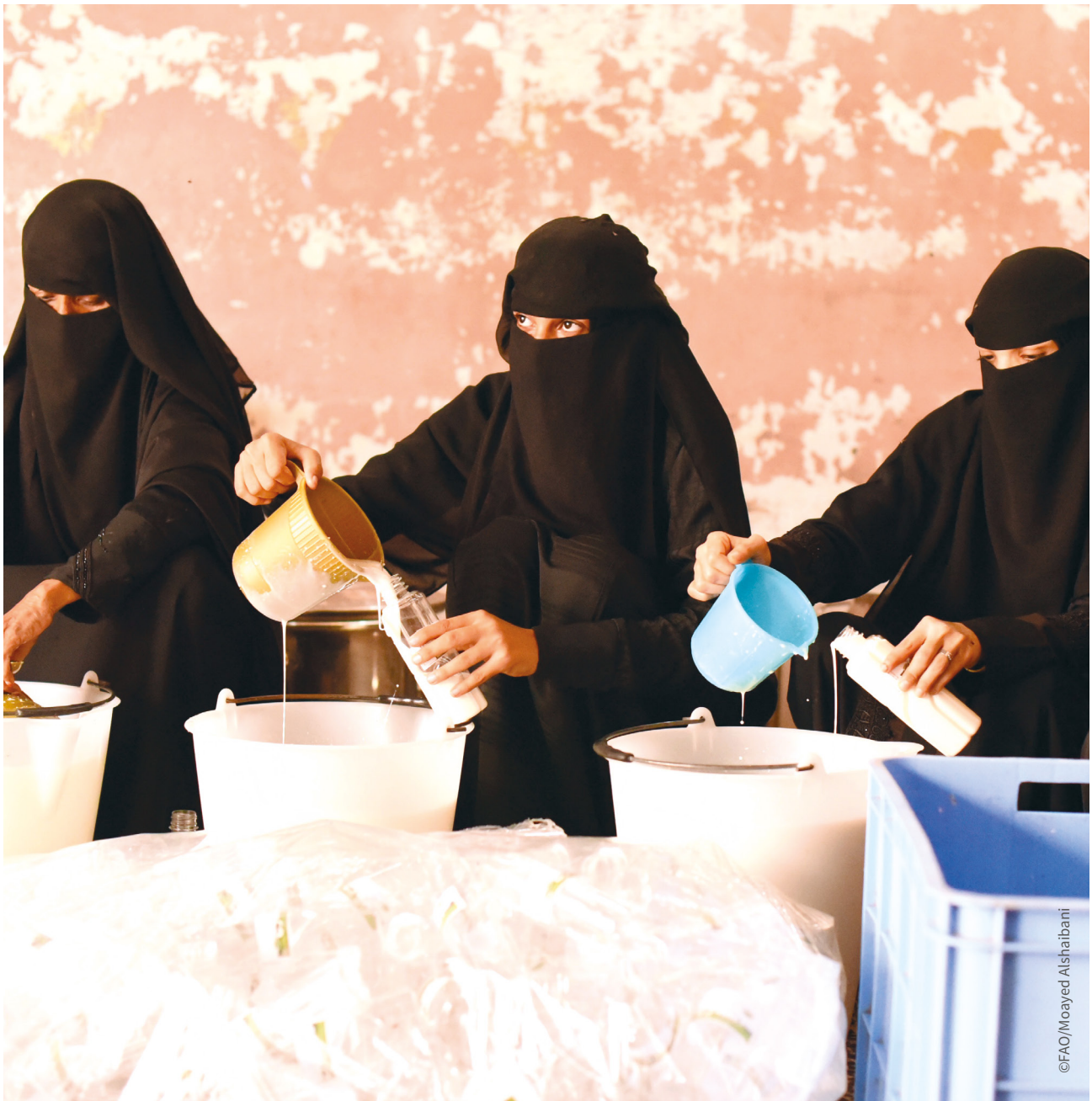
Photo: Women prepare raw milk to sell at the local market in Al Hudaydah.

The ELRP places special emphasis on safeguarding the livestock sector as it plays such an important role in nutrition and food security in Yemen, particularly for the most vulnerable