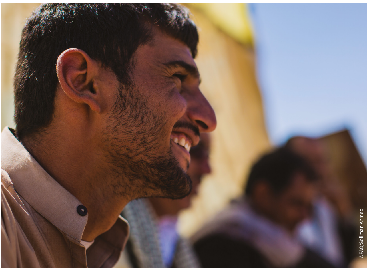
Photo: FAO's objective is to improve the food security and nutrition of the most vulnerable households in Yemen.

Given its mandate, technical expertise and more than 25 years of experience operating in Yemen, FAO is well positioned to take the lead on issues related to agriculture (crops, livestock and fisheries). It is currently operating in 16 out of the country's 22 governorates.