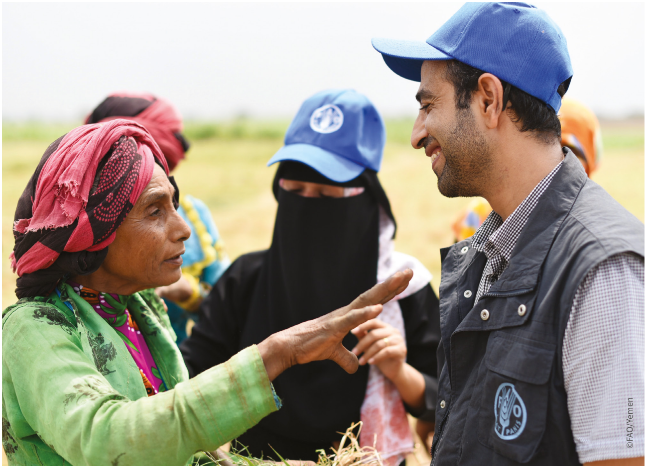
Photo: A woman speaks with FAO staff.