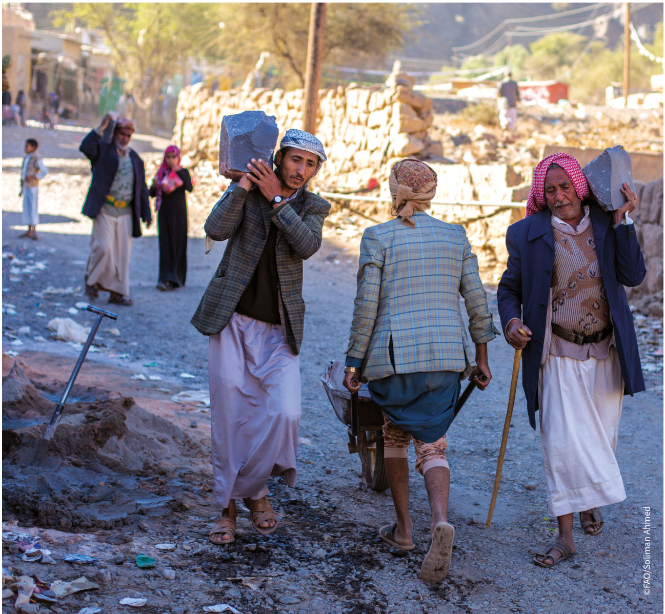
Photo: Villagers help to build a water storage facility in Sana'a.

people (IDPs) are sheltered in Hajjah, Taizz, Amanat Al Asimah and Amran governorates 2 . After three years of conflict, displacement is becoming protracted for the vast majority of IDPs, further deepening vulnerabilities. IDPs and host communities are rapidly exhausting their reserves. The prolonged displacement continues to put additional pressure on already scarce basic services.