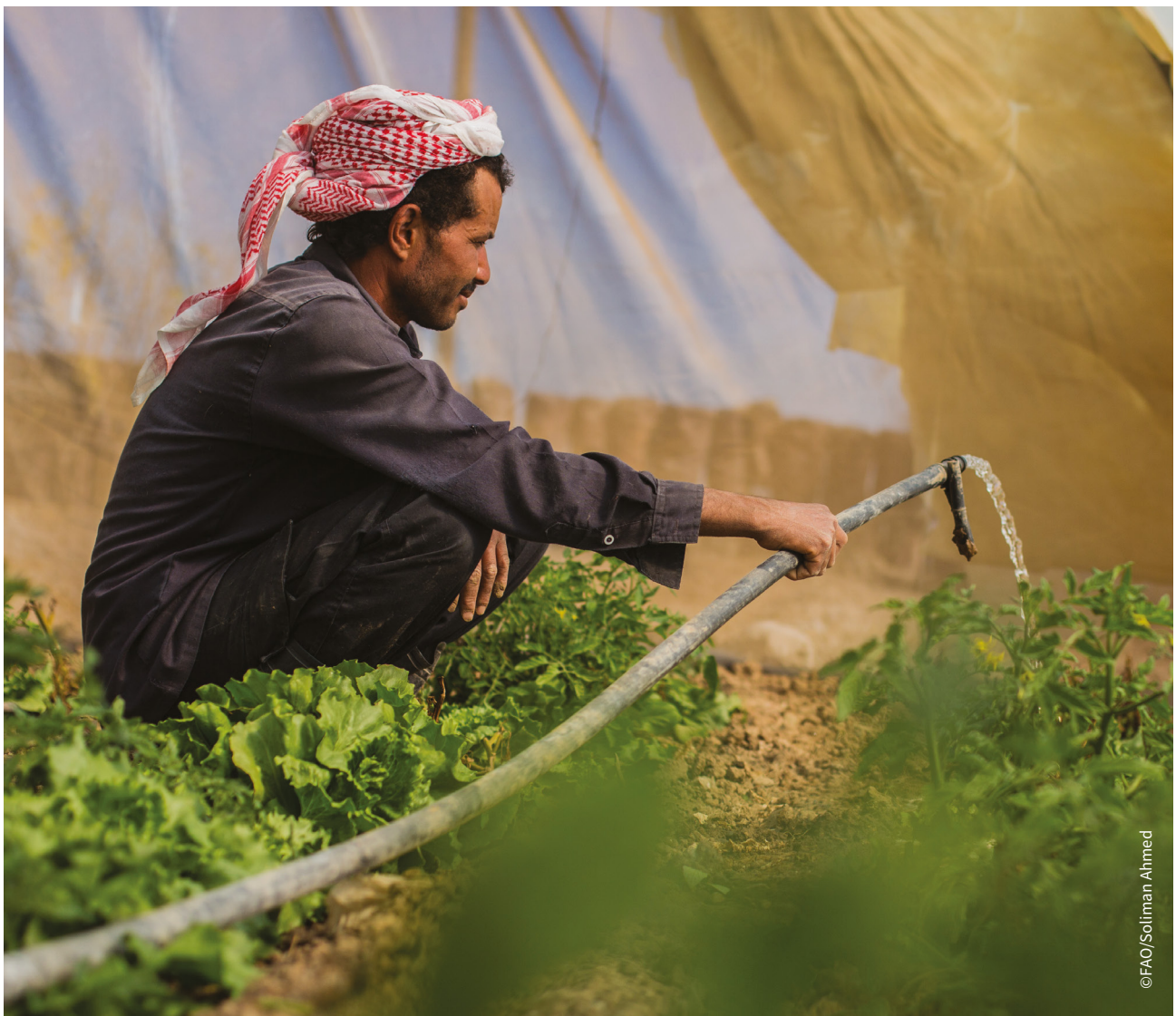
Photo: A farmer waters crops at a protected farm in Sana'a.

The sector most vulnerable to the effects of the phenomenon is agriculture, which is considered to be in need of immediate and urgent adaptation interventions. Climate change is causing increased periods of drought and unpredictable rainfall, while limiting the growth of sustainable, diversified and resilient rural livelihoods in Yemen. The already dire situation in the country is expected to worsen, with incidents of drought and extreme rainfall patterns becoming more frequent as the climate continues to warm.