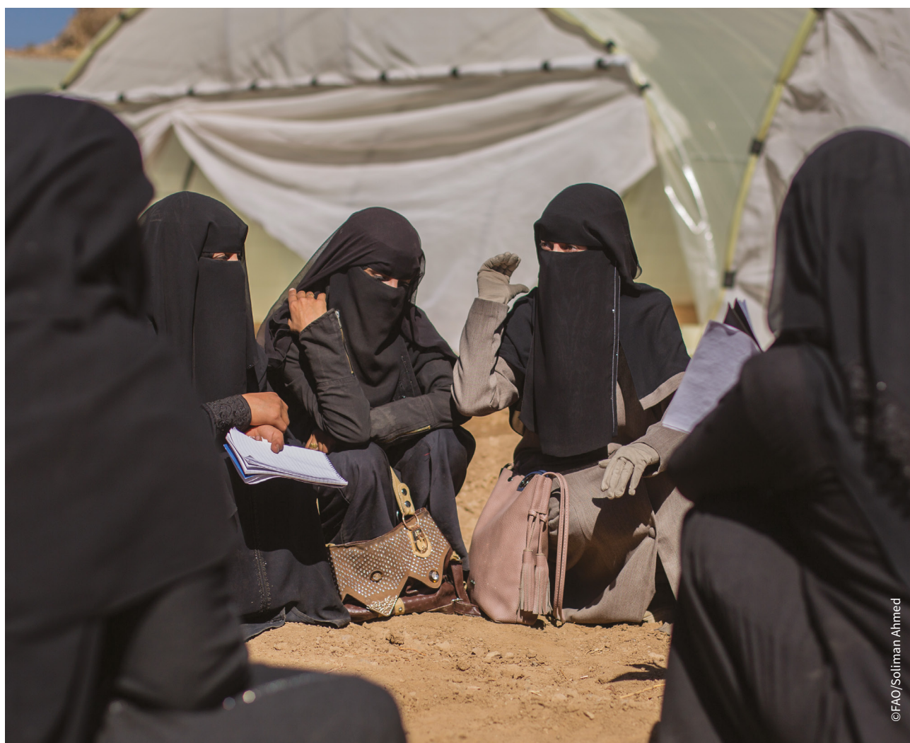
Photo: Engineers train women at a farmers' school.

To maximize reach, various groups will be targeted, including local institutions, government agencies, project partners (including NGOs and community-based organizations), the humanitarian community, local and international media, resource partners and beneficiaries.