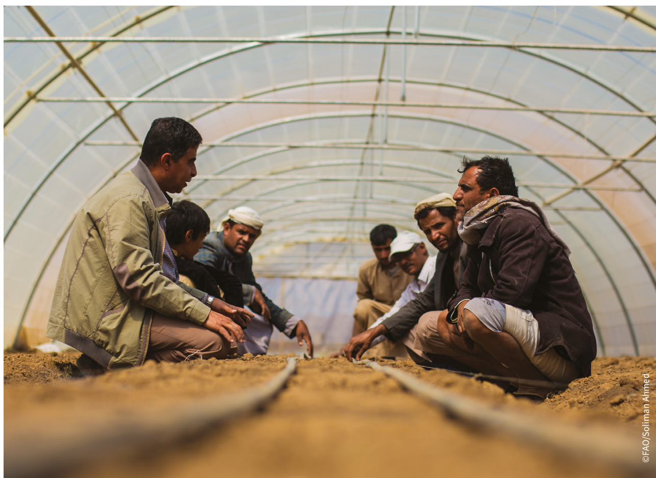
Photo: Engineers train farmers on planting and preparing protected farms.

FAO Yemen operations also benefit from the expertise available at the Regional Office for the Near East and North Africa in Cairo and FAO headquarters in Rome. FAO has developed resilience-based frameworks and action plans for a number of crisis-affected countries in the Near East and North Africa region and will provide important technical support in the various technical areas of the proposed action. FAO headquarters will support the proposed action as required, in particular through the Strategic Programme – Resilience, whose role is to provide technical assistance to country offices and share FAO's global knowledge in building livelihood resilience in the face of threats and crises.