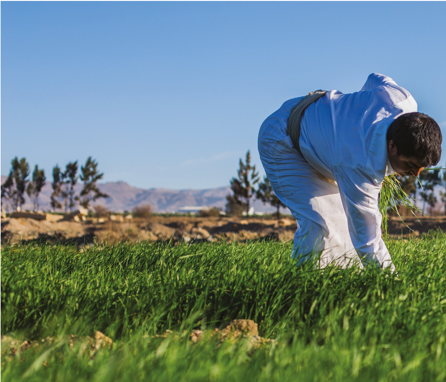
Photo: A farmer works in a wheat field.

In recent years, crop production has declined due to drought, insufficient and erratic rainfall, declining soil quality, poor crop management, crop