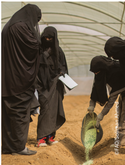
Photo: Engineers train women in planting and preparing protected farms.

Incomes in Yemen have fallen sharply and many public sector workers have gone for more than a year without being paid. As a result, 80 percent of Yemenis are now in debt, and more than half of all households buy food on credit. Most households – 60 percent – have resorted to negative coping mechanisms such as reducing their food portions or skipping meals.