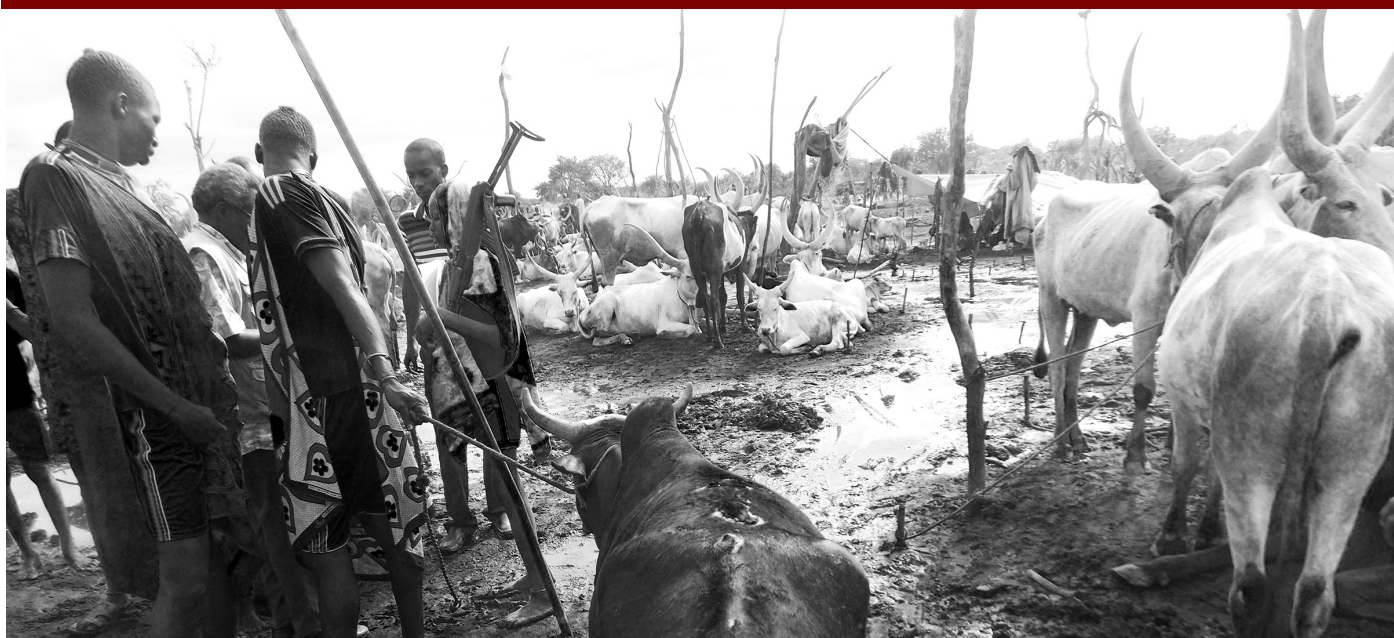
Cattle camp in Awerial.

One year on from the outbreak of violence in South Sudan, the country has devolved into two worlds: the areas affected by conflict, mostly in Greater Upper Nile, and the areas less affected by it. As of December 2014, Greater Equatoria and parts of Greater Bahr el-Ghazal have shown good crop production, robust market functioning, and generally speaking minimal food insecurity.