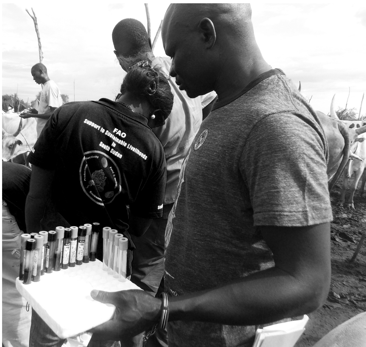
FAO teams collect livestock blood samples in Awerial for laboratory testing.

Coordination with partners already engaged in livestock support has also been strengthened to improve complementarity, effectiveness, monitoring and early warning.