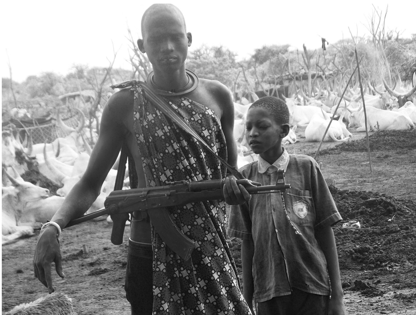
Pastoralists in Awerial.