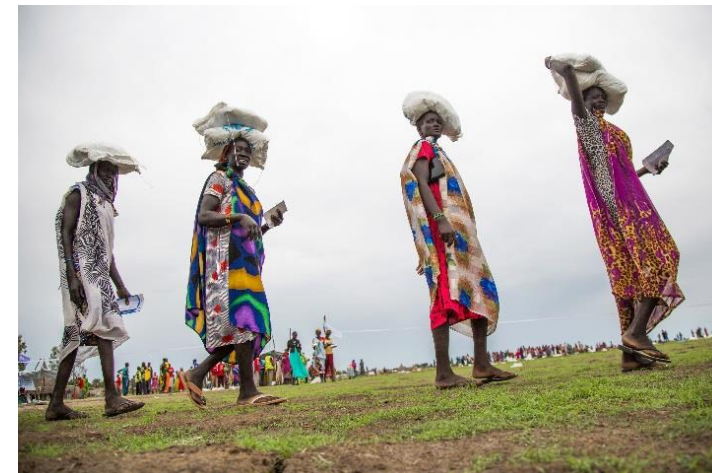
May 2017, Beneficiaries receive livelihood kits in Ganyiel County, Unity