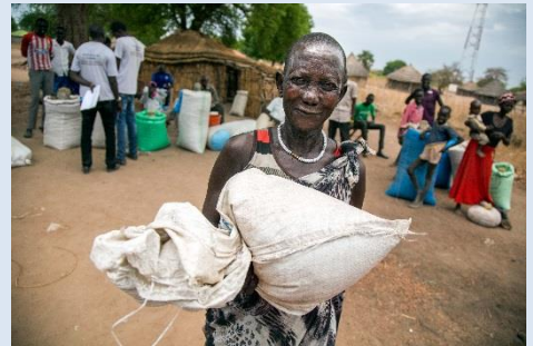
9 April 2017, Akot, Lakes State

“Last year I was sick during the planting season, so I was not able to plant and life has been very tough. I am able to get some money by going out early in the morning and cutting grass to sell at the market. It is a very tough job since many people are doing it, so you need to get up very early in the morning and get to the place before the others. [...] Sometimes you find soldiers waiting for you, it is not safe! I don’t have any food to eat, so I have to collect what I can from what is around me. There are wildfoods that I eat and bring back for my child, but sorghum is the most important thing. With these seeds I’ve received I’ll plant 1.5 feddans this year.”