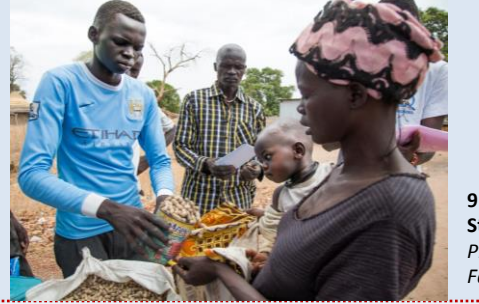
9 April 2017, Akot, Lakes State

“Today I am selling the extra seeds that we have at the seed fair like we did last year. From our income of the seed fairs last year, we were able to expand on our business and plant more feddans . The FAO representatives come to us and we negotiated on the price, and we actually wanted a bit more money but in the end agreed it is fair price! [...] We never have hunger in our family because of these seeds, so we are lucky.”