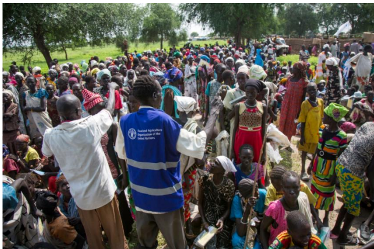
June 2017, Padding, Jonglei State FAO rapid response distribution

ICRM is a multi-sectoral, inter-agency humanitarian response led by OCHA aiming to reach vulnerable communities in given locations. As part of the ICRM, FAO distributed 3 000 fishing and vegetable kits in Padding between the 30 June and the 5 July.