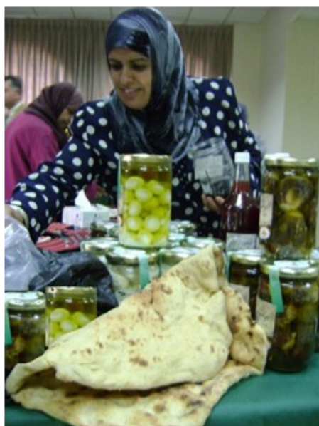
The project beneficiaries were able to sell home-made cheese, breads and pickles, among other products