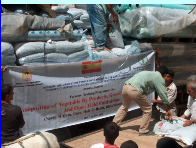
Project inputs are distributed

The project OSRO/GAZ/604/SPA, funded by the Government of Spain, was also recently completed, and saw 568 fruit and vegetable farmers in the Gaza Strip benefit from the provision of agricultural inputs and irrigation equipment, greenhouse rehabilitation and training. It is hoped that the crops grown with the assistance of this project will help to alleviate the high food prices currently crippling the Gaza Strip, and will deter Gazan farmers from abandoning farming in the face of supply and export difficulties.