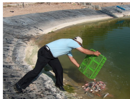
A project beneficiary adds fingerlings to his newly-rehabilitated storage pond

tion of their storage ponds. Finally, 73 Ministry of Agriculture staff received intensive training. FAO is happy with the results of the project,