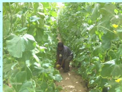
A Gazan farmer inspects his crops, irrigated with equipment provided by this project