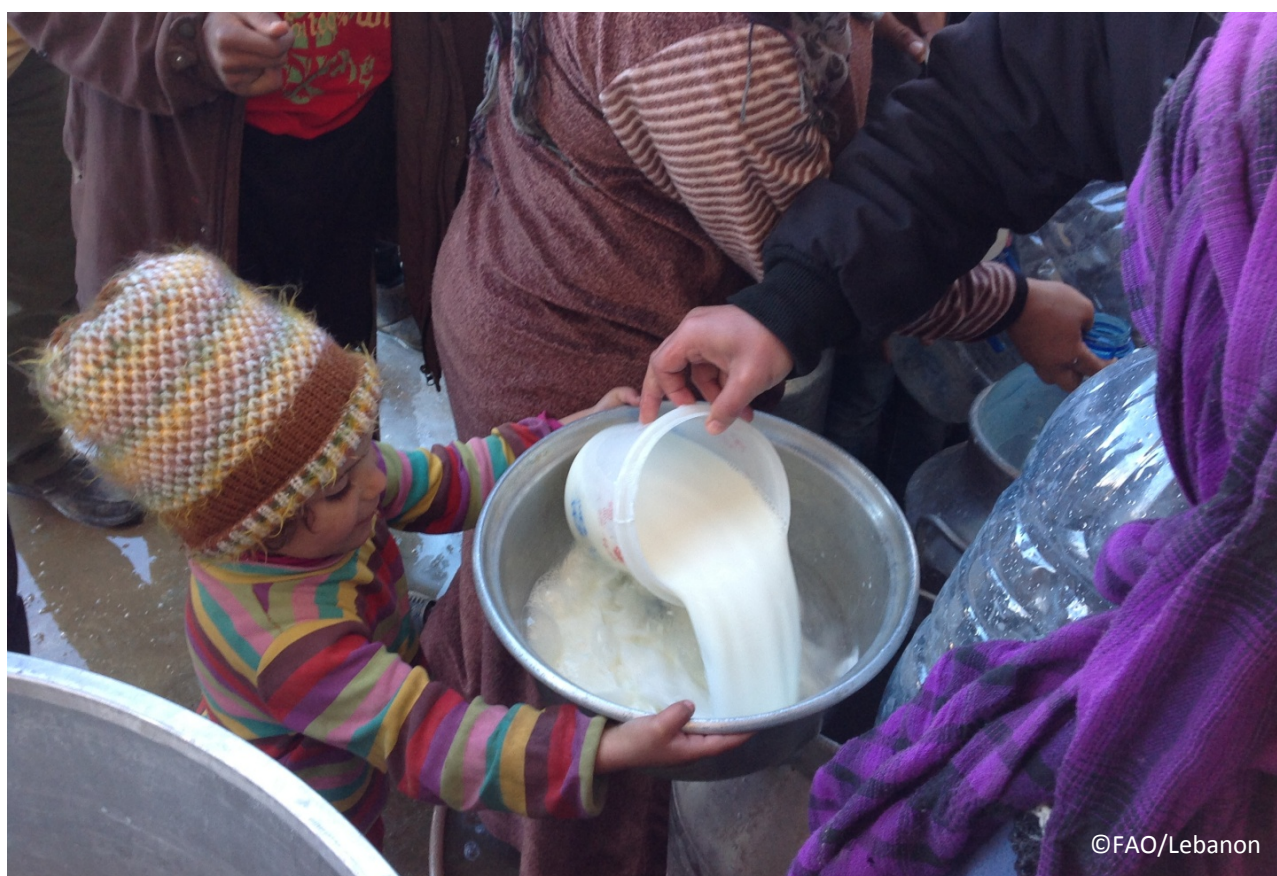
A Syrian child refugee – living in the Informal Tent Settlement in Dalhamayyeh (Central Bekaa) in Lebanon – receives milk from a nearby milk collection centre, equipped and functioning with FAO support.

In this context, FAO's Subregional Strategy and Action Plan (detailed below) identifies key emergency response, agricultural restoration, livelihood recovery, risk-sensitive agricultural development and related policy and capacity development interventions aimed at: humanitarian relief for IDPs, refugees and returnees; recovery and stabilization of national agriculture sectors; and strengthening the resilience of Egyptian, Iraqi, Jordanian, Lebanese and Turkish host communities to help them withstand the impact of the Syria crisis.