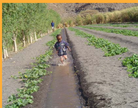
Child playing in an irrigated cultivation plot established with FAO support

Even for Djibouti's arid climate, rainfall in recent years has been extremely low and erratic, with devastating impacts for the country's remaining pastoralist communities. Herders have lost between 40 and 70 percent of their animals and struggle to maintain their surviving livestock in the face of poor animal health, degraded pastureland and insufficient water supplies. The drought has also caused a dramatic reduction in ground water levels, while degraded irrigation networks make it difficult to distribute the little water available. The resulting dive in crop production has pushed many farmers into a state of extreme poverty and rendered them unable to acquire the inputs they need.