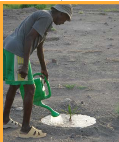
Crop cultivation enables pastoralist families to diversify their incomes

Furthermore, the project will develop rainwater harvesting techniques to improve the availability of fodder and pastureland. Regional markets will be organized under the project to assist herders in selling their animals and improve local infrastructure for livestock trade. Along with the project's capacity-building component, these interventions will enhance the ability of beneficiary families to withstand future shocks and emergencies.