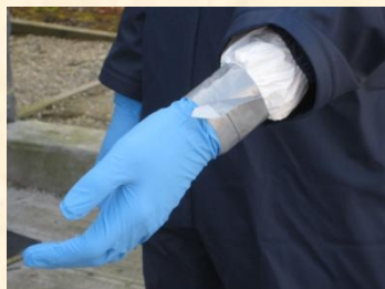
15. Tape outer glove to sleeve of disposable suit