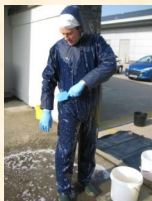
6. Disinfect remainder of waterproof suit