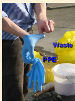
14. Remove second inner glove by hooking thumb under cuff - place in waste bag