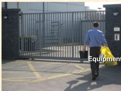
5. Carry equipment to site in plastic bag