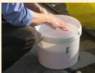
17. Disinfect hands using 6-step procedure