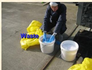
1. Disinfect equipment & outside of sample boxes/bags