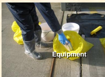
2. Place equipment & samples in equipment bag on clean side