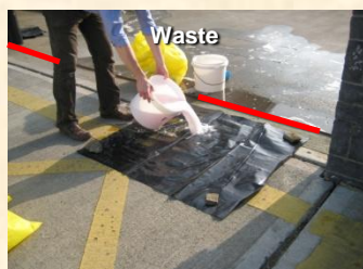
19. Pour disinfect over plastic mat & place mat in waste bag