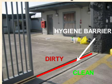
6. Identify suitable location for clean/dirty separation