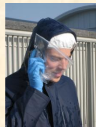
18. When on site, do not remove mobile phone from zip-lock bag