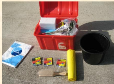
1. Prepare equipment & PPE (protective clothing) before travelling