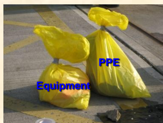
15. Double bag & seal the equipment & PPE bags