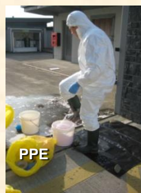
11. Step onto clean side & disinfect boots