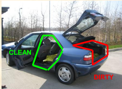
2. Prepare "clean" & "dirty" areas in car