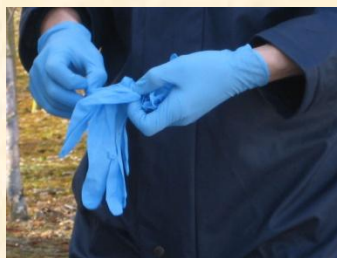
13. Put on two pairs of disposable gloves