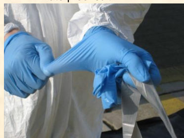
10. Remove second outer glove by hooking thumb under cuff - place in waste bag