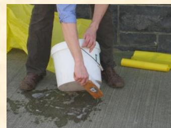
16. Disinfect outside of bucket