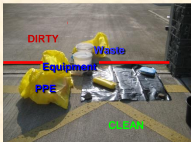
7. Prepare clean & dirty disinfection points at hygiene barrier