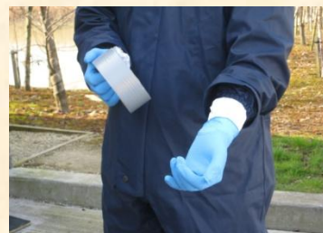
14. Pull sleeve of disposable suit down between the two pairs of gloves