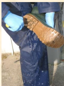
5. Clean soles of boots thoroughly & disinfect