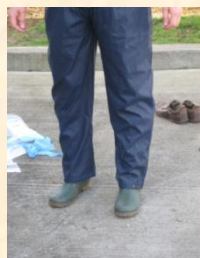
11. Pull down legs of waterproof suit outside boots