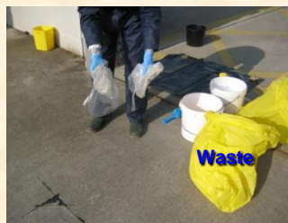
3. Remove boot covers & place in waste bag for disposal