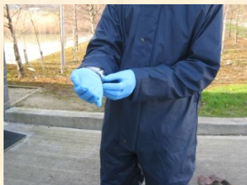
16. Pull down sleeves of waterproof suit outside gloves