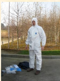
8. Put on disposable suit