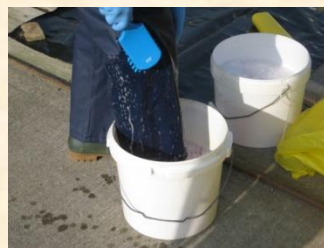
4. Disinfect legs of waterproof suit