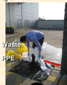
12. Remove disposable suit & place in waste bag on "dirty" side