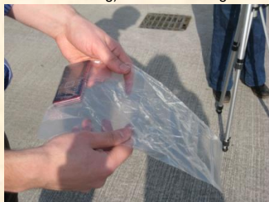
4. Place mobile phone in zip-lock bag