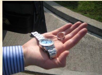
3. Remove watch & jewellery before leaving car