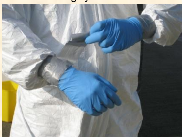
9. Remove first outer glove – touching only the outer surface