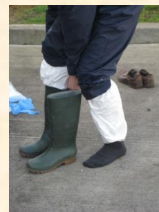
10. Put on boots – putting legs of disposable suit inside boots