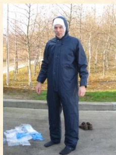
9. Put on waterproof suit