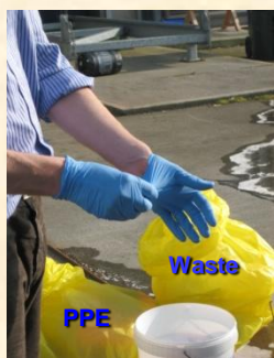
13. Remove first inner glove – touching only the outer surface