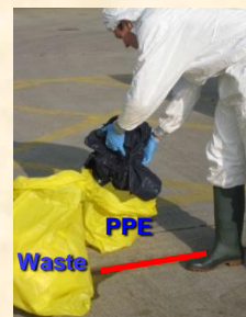
8. Place suit in PPE bag on "clean" side