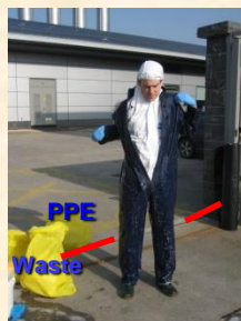
7. Remove waterproof suit