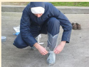
12. Put on boot covers