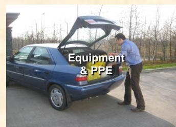
20. Place equipment & PPE bags in "dirty" area of car