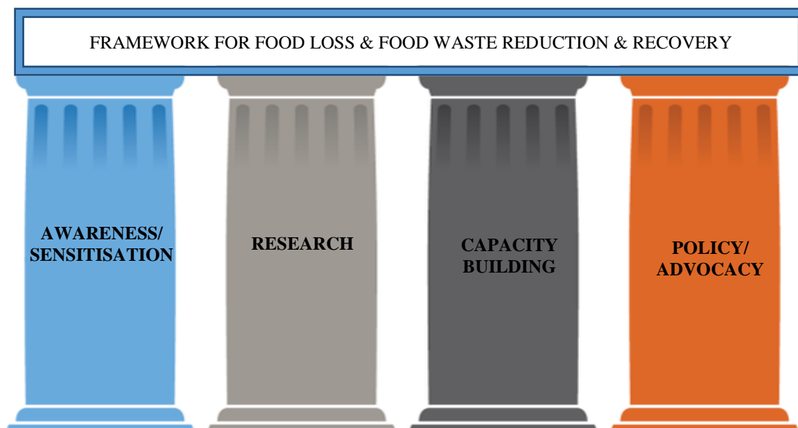
Figure 2: The four pillars of the FLoWeR 2 Initiative framework