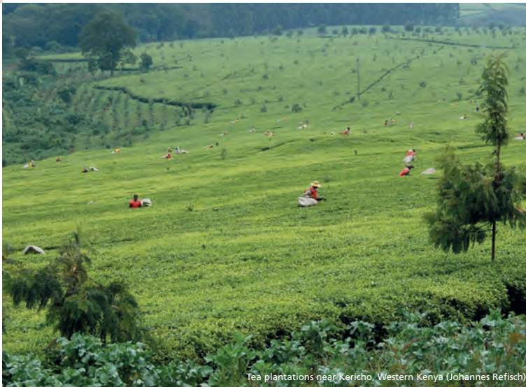
Tea plantations near Kericho, Western Kenya (Johannes Refisch)

The sustainability of ES in African mountains is at great risk. First, poverty and environmental degradation threaten the integrity of mountain ES. This is aggravated by population growth, land-use conflicts and political insecurity. Second, the effects of climate change are most noticeable in mountains, requiring local populations to adapt to new conditions.