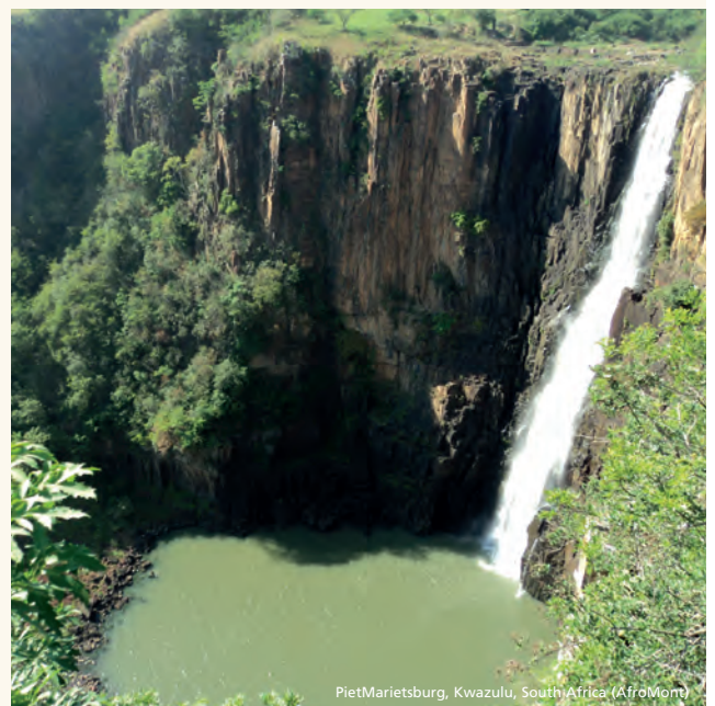
PietMarietsburg, Kwazulu, South Africa (AfroMont)

The flow of ES from mountains to lowlands is essential to promote sustainable development and poverty eradication throughout the continent.