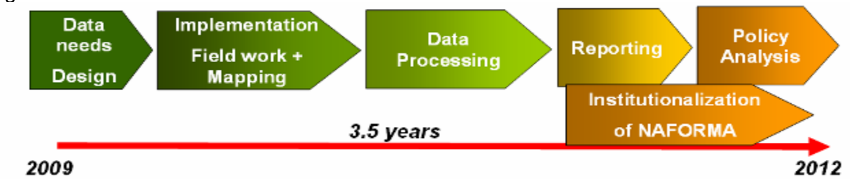
Figure 1: NAFORMA Phases

In the revised Project Document the new methodology and sampling design are explained in detail. The objective "Develop Tools and methods for integration of REDD+ MRV (Monitoring, Reporting and Verification) to National Forest Monitoring and Assessment (NFMA) methodology" was added as the seventh immediate objective while some of the outputs and activities were updated. Hence the seven immediate objectives of NAFORMA are: