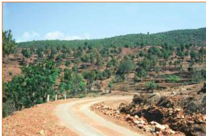
Namdu, Dolkha -1989