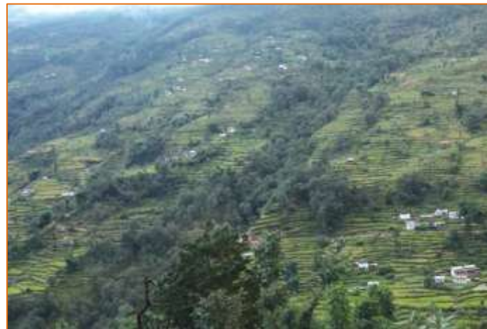
Bonch - 2010