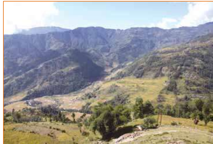
Serabasi - 2010