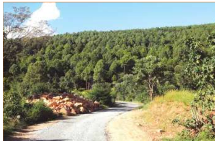
Namdu, Dolkha -2010