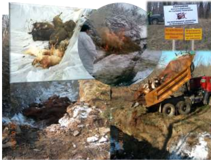
Lumpy skin disease and bluetongue training of trainers in FYR of Macedonia