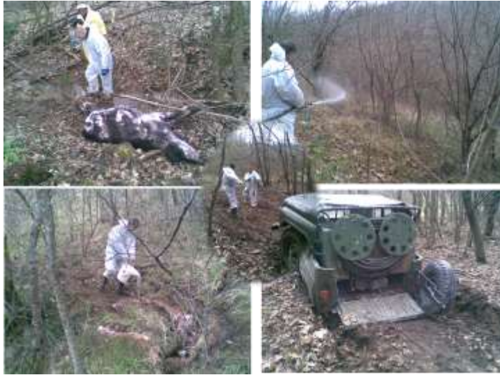
Lumpy skin disease and bluetongue training of trainers in FYR of Macedonia