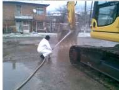
Lumpy skin disease and bluetongue training of trainers in FYR of Macedonia