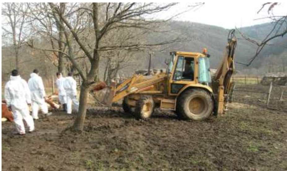
Lumpy skin disease and bluetongue training of trainers in FYR of Macedonia