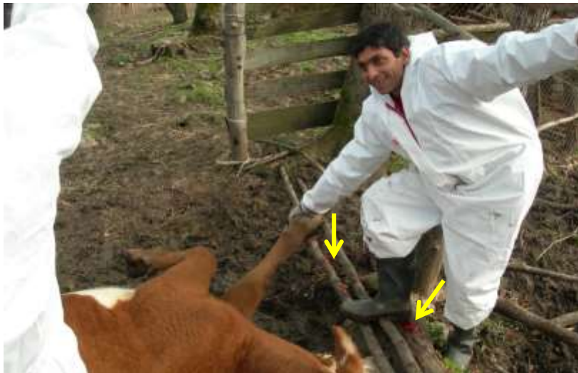
Lumpy skin disease and bluetongue training of trainers in FYR of Macedonia