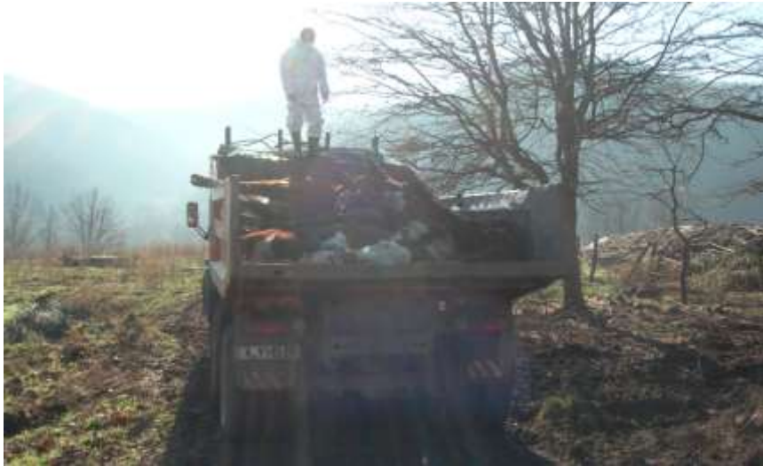
Lumpy skin disease and bluetongue training of trainers in FYR of Macedonia