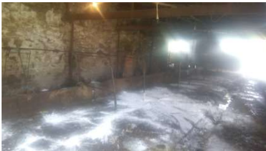
Lumpy skin disease and bluetongue training of trainers in FYR of Macedonia