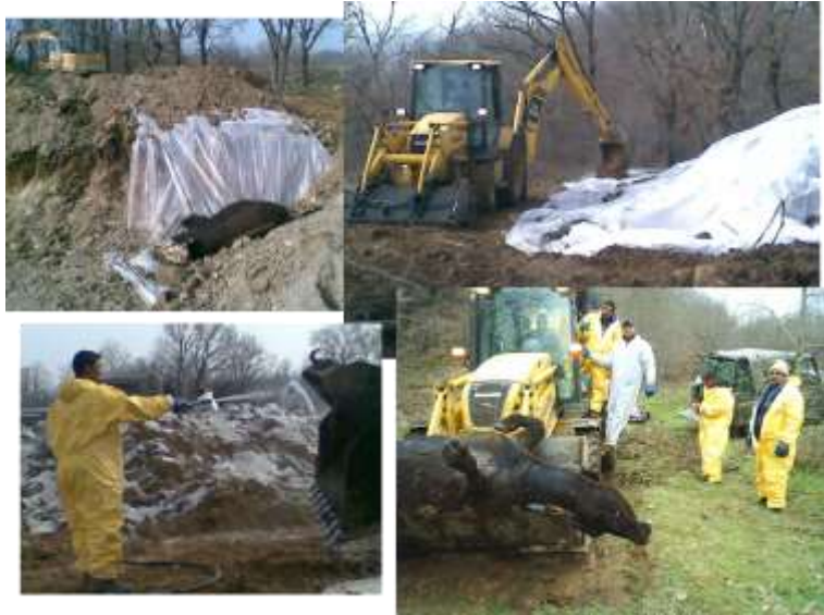
Lumpy skin disease and bluetongue training of trainers in FYR of Macedonia