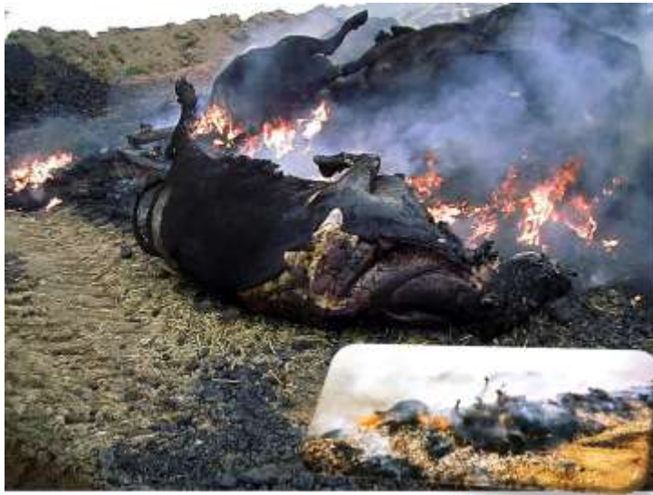
Lumpy skin disease and bluetongue training of trainers in FYR of Macedonia