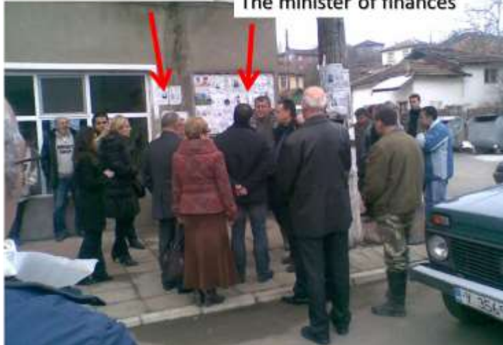
Lumpy skin disease prevention, control, and awareness workshop