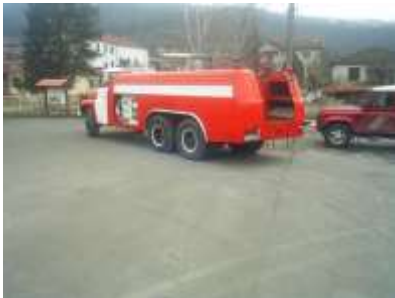
The fire brigade