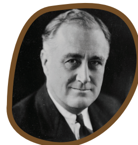
1882-1945 Franklin Delano Roosevelt

Can you think of three ways you depend on soils every day?