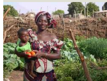
Beneficiary in her vegetable garden, Côte d'Ivoire, FAO.