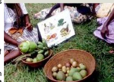
Nutrition education in Uganda, FAO