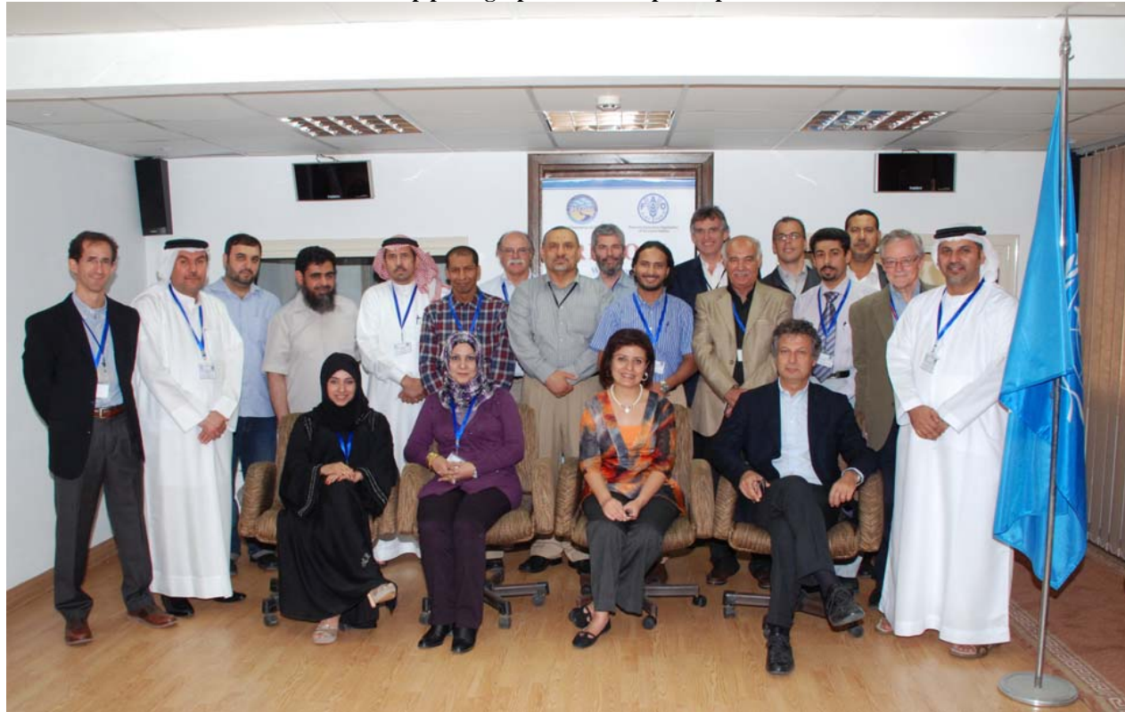
Group photograph of selected participants 32