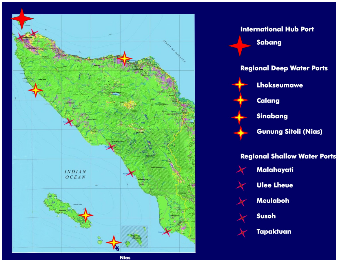
Figure - Strategic Location of Ports of Aceh

The long-term strategy is to have a network of large and small ports for the province and for Nias with Sabang acting as a hub port. The general arrangement is shown in Figure 4