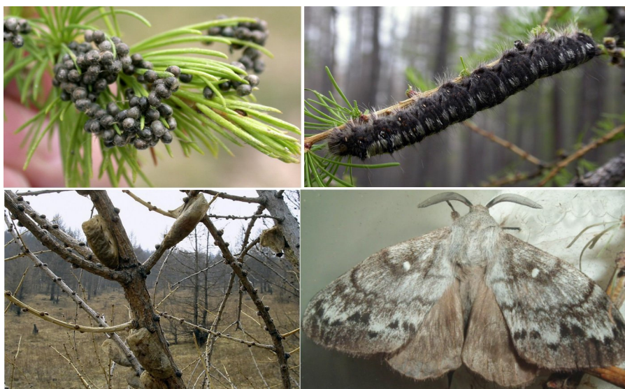
Dendrolimus sibiricus life cycle stages - eggs, larva, pupae, adult

Widespread on the Asian continent, the Siberian caterpillar is a destructive pest of conifers causing significant defoliation of trees in both naturally regenerating and planted forests. It is able to attack and kill healthy trees and it has been known to kill forests across very wide areas.