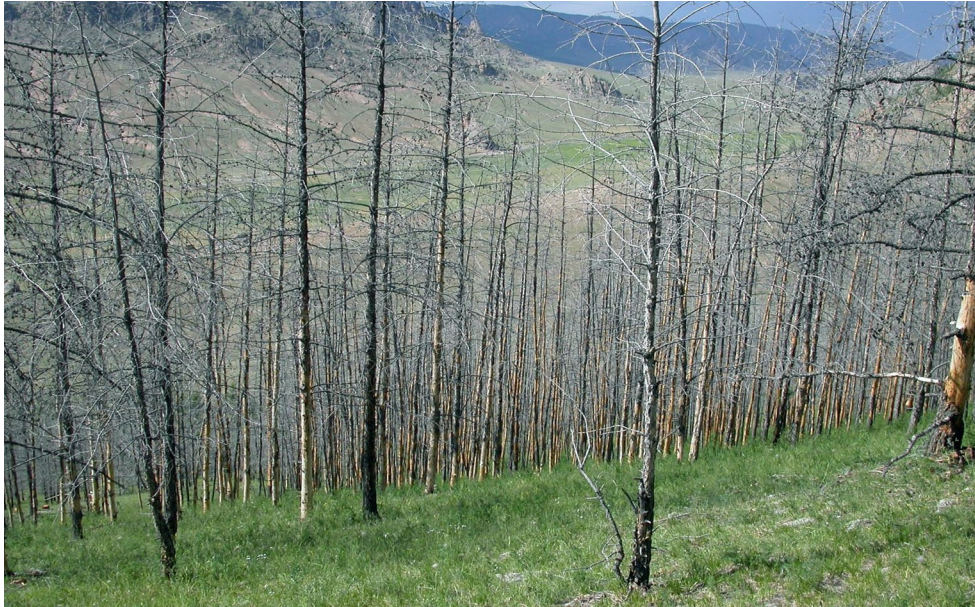
Siberian larch ( Larix sibirica ) defoliated by the Siberian caterpillar, Mongolia