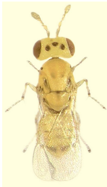
Aprostocetus sp., a natural enemy of L. invasa , recently released in Israel

Leptocybe invasa on nursery stock is controlled by systemic insecticides. Research on possible biological control agents is ongoing in Australia and Israel. Several natural enemies of this pest were found in Australia including parasitic wasps from three genera Aprostocetus , Quadrastichus (Eulophidae) and Megastigmus (Torymidae).