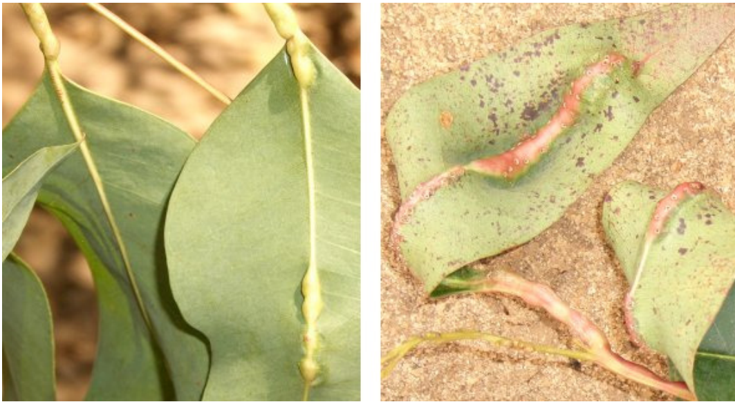
Damage caused by the wasp Leptocybe invasa on Eucalyptus branches and leaf petioles, Kibaha, Tanzania. Left: young galls; right: older galls with exit holes