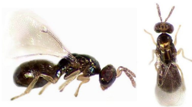
Adult female Leptocybe invasa

The blue gum chalcid, Leptocybe invasa , is a newly described insect that is a major pest of young eucalypt trees and seedlings. Native to Queensland, Australia, it is currently spreading through Africa, Asia and the Pacific, Europe and the Near East. Information on the taxonomy, distribution, biology and economic impacts of the blue gum chalcid are still being investigated.