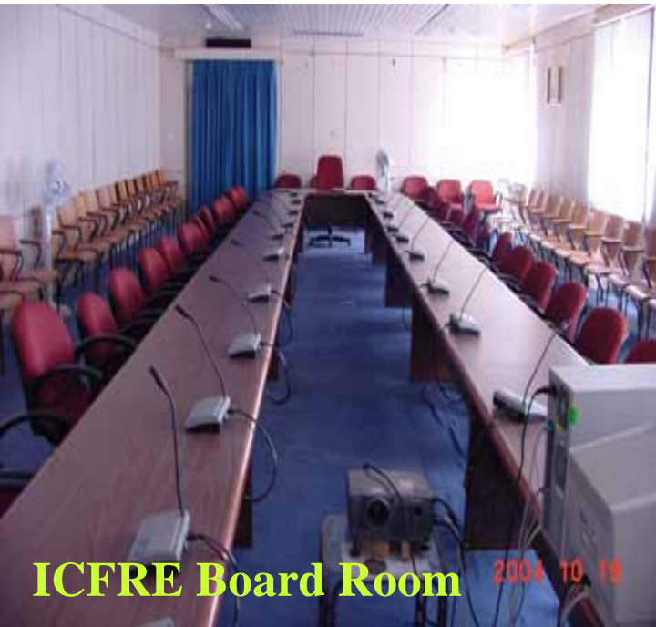
ICFRE Board Room