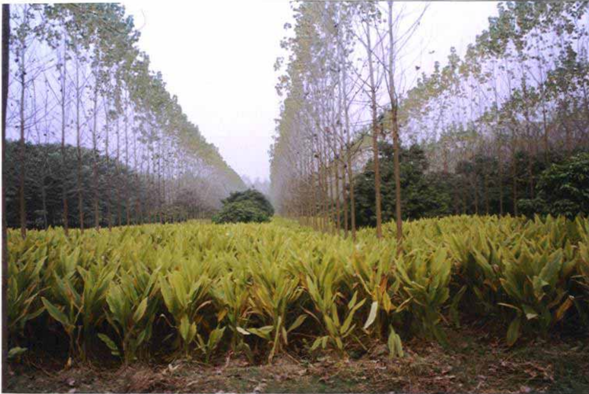
Poplar-turmeric agroforestry model at Hara Farm, Yamunanagar, Haryana