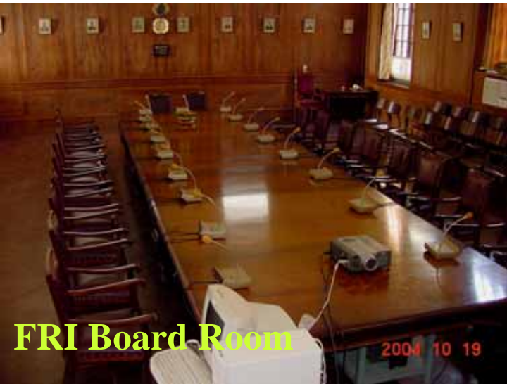
FRI Board Room