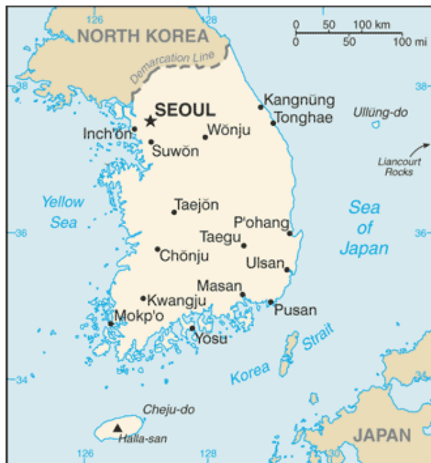
Figure 1. Map of South Korea