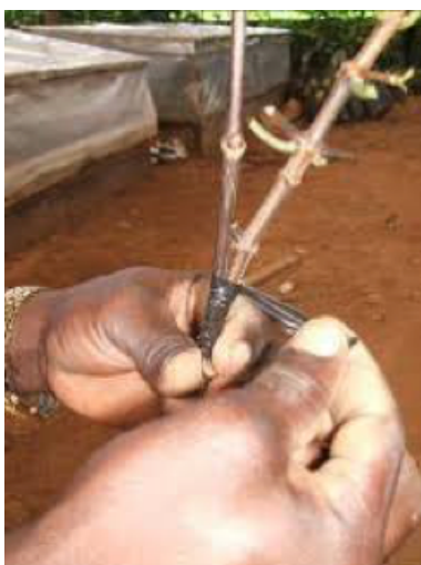
Figure 12. Scion inserted in place and binding with a grafting tape