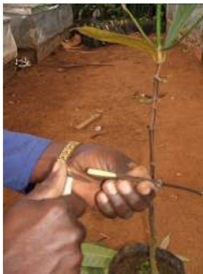
Figure 10. Making the incision on the rootstock