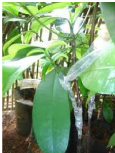
Figure 13. Successful graft ready for topping and removal of tape

the scion and union to prevent excessive moisture loss prior to healing. The graft is successful when the scion produces new growth, the plastic bag and grafting tape are then removed.