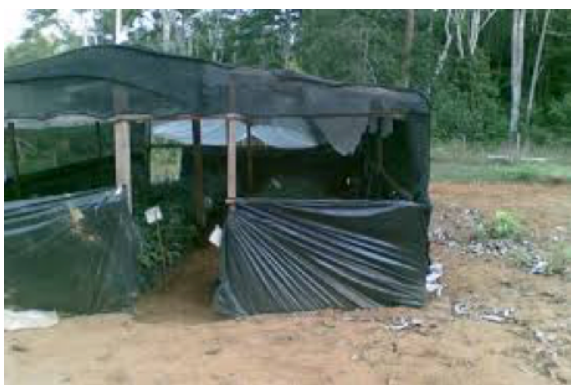
Figure 18. Allanblackia spp plants in a green house