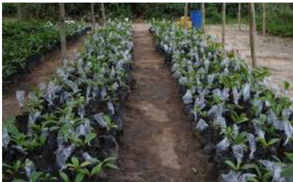
Figure 17. Allanblackia spp plants after grafting