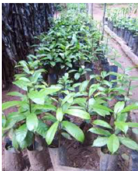
Figure 1. Healthy rootstocks in the nursery ready for grafting

This is required for the formation of the graft union, to allow the effective movement of the nutrients and water needed for plant growth between roots and shoots.