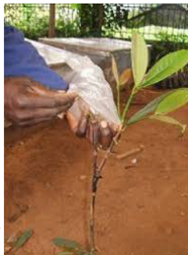
Figure 14. Rootstock cut above the point of union after the wound has healed with the scion