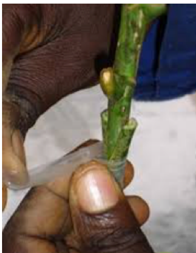
Figure 7. Tying the union with grafting tape and plastic bag to avoid excessive water loss