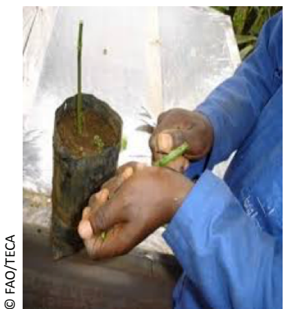
Figure 3. Scion prepared and inserted into the rootstock

Regardless of the grafting method, scions are generally treated beforehand with fungicide to prevent fungal infections. Grafting equipment should also be sterilised by dipping in 95 percent ethanol before and during grafting.