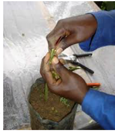
Figure 4. Scion prepared and inserted into the rootstock

deep enough to accommodate the wedge of the scion. The scion is prepared by making two sloping cuts to form a 'V' shape wedge. This is then inserted into the cut in the rootstock, making sure the cambium layers match up.