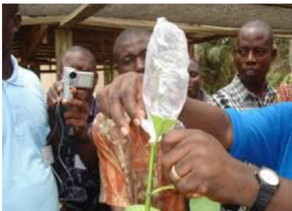
Figure 8. Tying the union with grafting tape and plastic bag to avoid excessive water loss