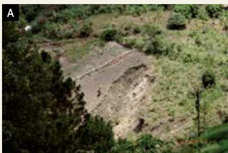
(A) Farms under monoculture exhibited high levels of damage in the form of mudslides.