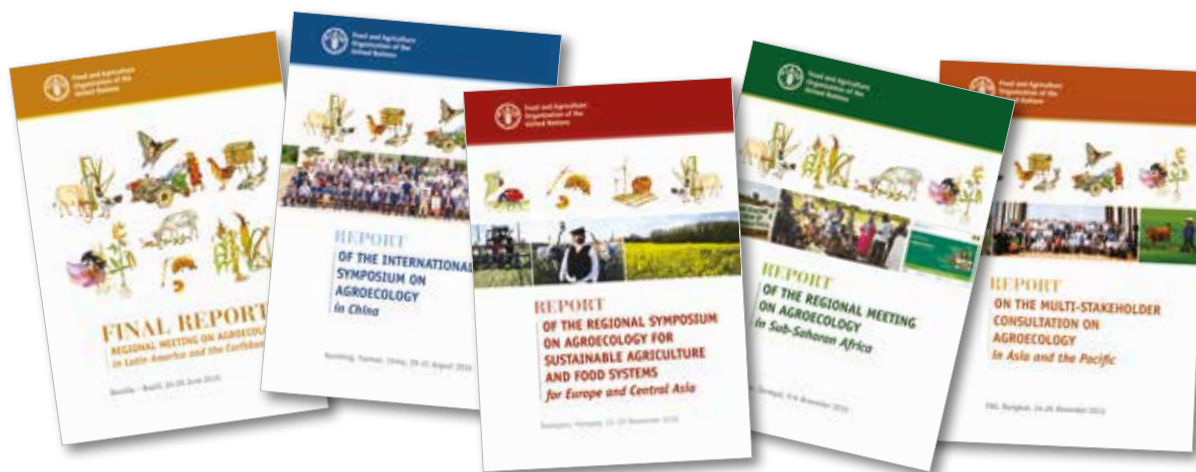
Figure 1 Reports of the FAO regional seminars

These seminars provided many opportunities for exchange and debate and revealed that while the scientific framework for agroecology dates back to the last century, it is a living concept and can be interpreted differently by different actors. The seminars gave rise to significant debates on the future of agriculture and the role of agroecology in food and nutrition security and gave the opportunity to regional actors to work together. The participants' testimonies showed not only the wealth of existing initiatives but also their high expectations about supporting an agroecological transition on a larger scale.