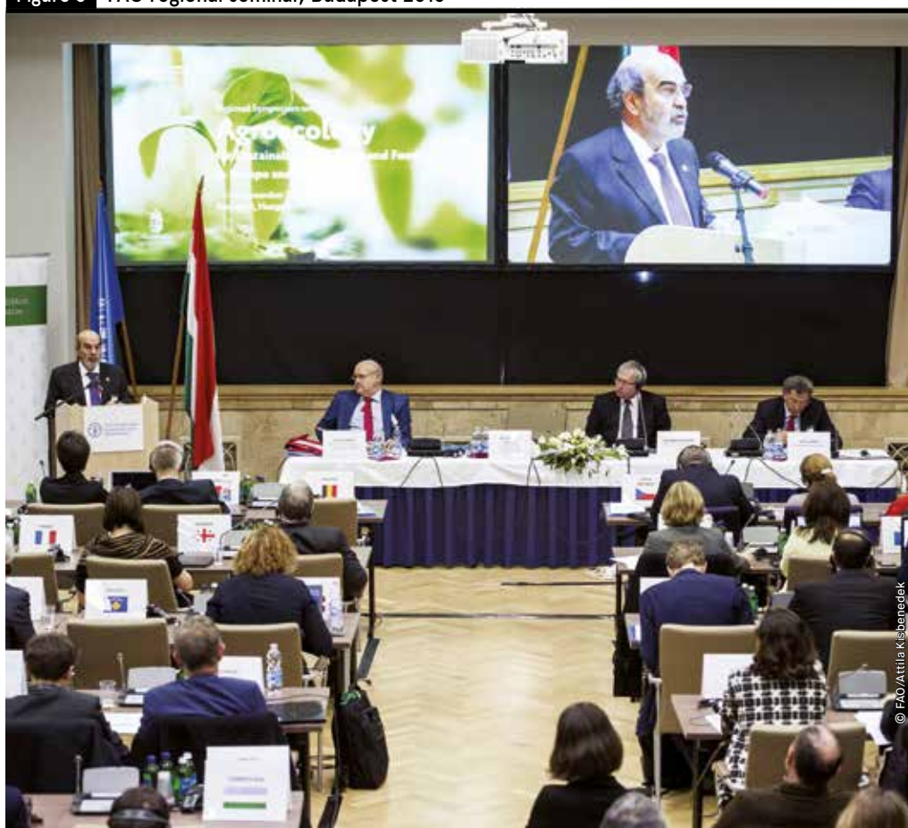
Figure 3 FAO regional seminar, Budapest 2016

There are several ways of understanding agroecology that often differ according to stakeholder group, reflecting diverging visions, objectives and strategies. There are also variations between and within regions due to differing histories and trajectories. This diversity in the way agroecology is understood is at the heart of the debate. While there is consensus around the ecological principles that underpin agroecology, there are multiple views on what sustainability entails in the broadest sense and how to achieve it, pointing to the need for continued evidence building and dialogue. Participants in all regions welcomed the interest of a wide range of actors in agroecology. Nevertheless, civil society actors in particular warned against the risk of agroecology being reduced to a set of farming practices without addressing wider systemic issues such as governance of food systems.