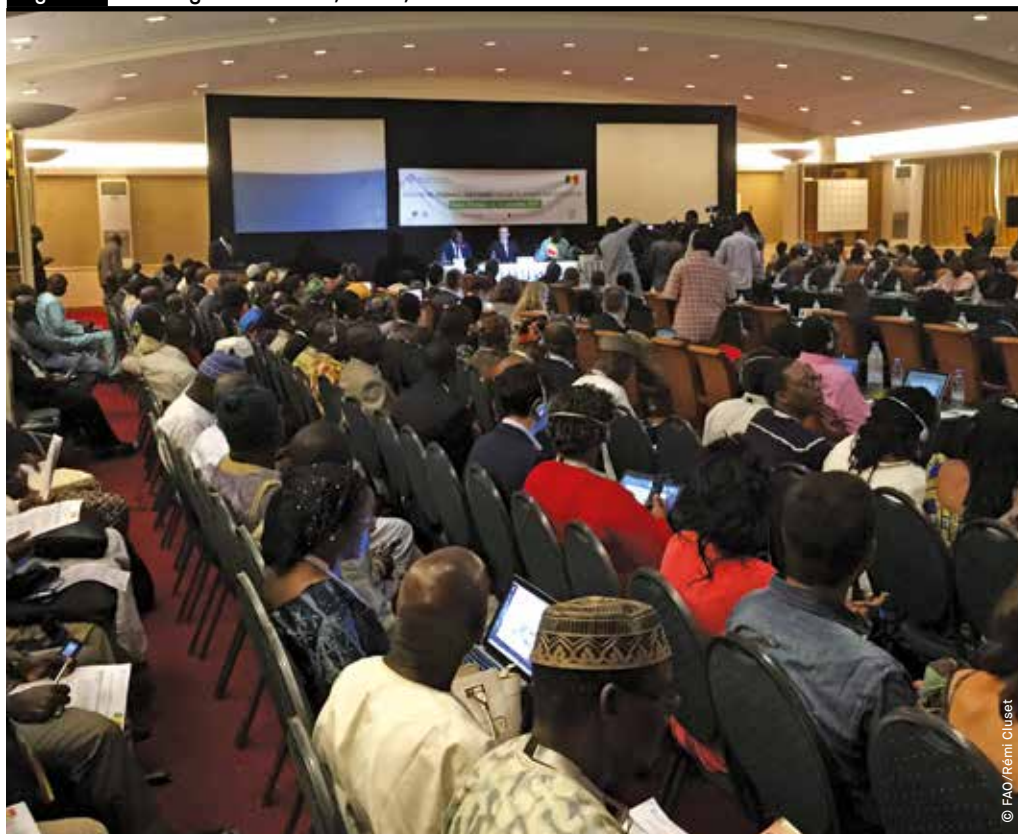
Figure 2 FAO regional seminar, Dakar, 2015

but rather presents a synthesis of the discussions in the seminars. For example, although the debate on agroecology integrates the agricultural, forestry and fisheries sectors, it is necessary to recognize that most of the debates focused on the agricultural sector, which is reflected throughout this document. Similarly, because the document gives priority to the information gathered at the multistakeholder seminars, the use of scientific references is intentionally reduced.