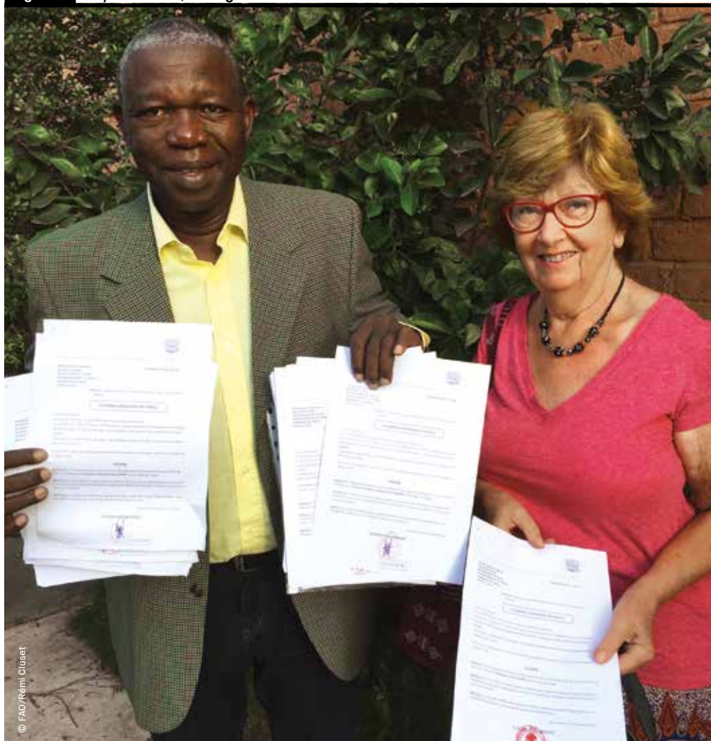
Figure 4 Kaydara Farm, Senegal: land tenure certificates delivered to the students

Since agroecology is highly location specific and knowledge intensive, people-to-people learning is key for facilitating the spread of knowledge, including specific tools such as FFS at local levels. FFS approaches were developed and scaled up by FAO in Asia during the late 1980s and early 1990s, and are now unanimously recognized as a powerful extension instrument for fostering agroecological principles as they build farmers' capacities to observe and react to ecological processes. Many organizations have used FFS for engaging a strong scientific and experiential learning process on issues relevant to agroecology, such as organic farming, Integrated Pest Management (IPM), Integrated Soil Management (ISM), Sustainable Rice Intensification (SRI), and more than 1 million farmers were trained through the IPM-FFS programme.