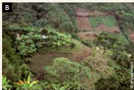
(B) Neighbouring biodiverse farms featuring agroforestry systems, contour farming, cover crops etc. exhibited less damage.