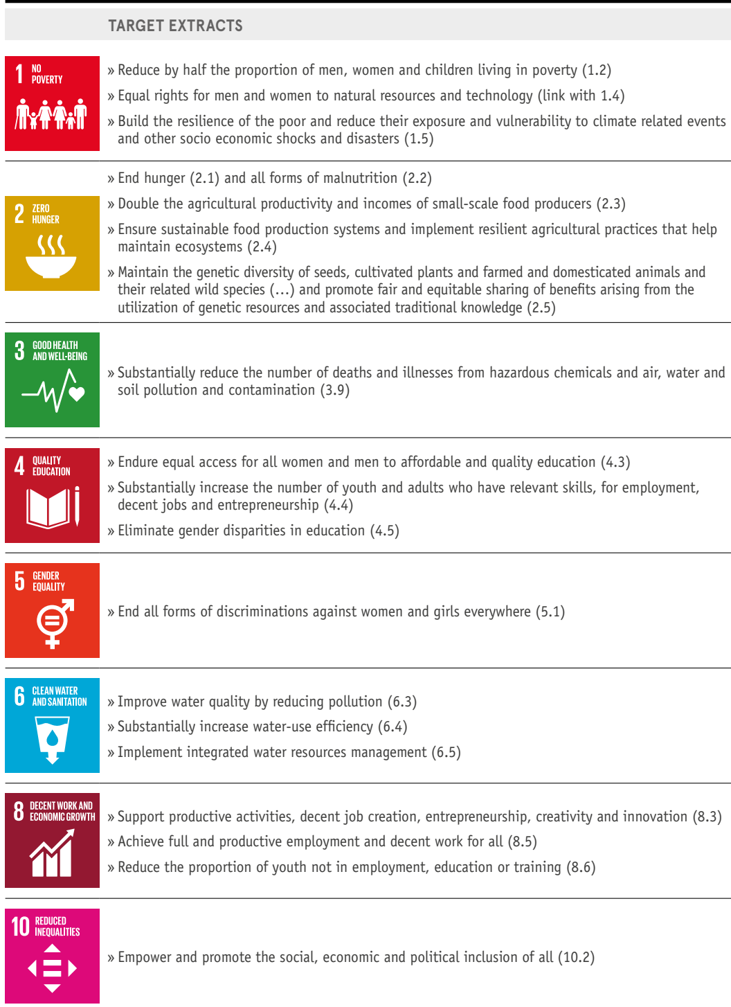
Table 3 Agroecology contribution on SDGs