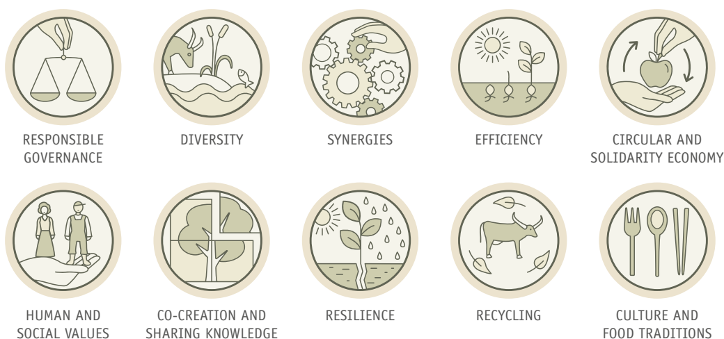
Figure 5 The 10 Elements of agroecology

The 10 Elements consider major environmental, social and economic characteristics, processes and enabling-environment factors – and their interactions – typical of diversified agricultural systems that are guided by agroecological principles and practices. They also recognize the great potential of collective action processes to foster knowledge sharing, and to deepen understanding, enabling behavioural changes in food systems that are required for sustainable agriculture to become a reality.