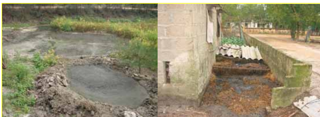
Environmental pollution caused by household's pig raising

Left unsolved, it may potentially create social conflicts among local people. A study of animal waste treatment conducted in Thai Binh province found that pig dung pollution resulted in bitter conflicts between pig raising farmers and their neighbours.