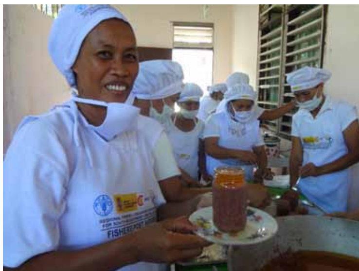
Members of women's groups in the Philippines take part in RFLP supported training to make improved shrimp paste.

Of the livelihoods activities supported by RFLP approximately 41% were women focused, 49% mixed and just 10% were carried out by men only. Women's livelihoods activities included producing or improving a variety of fish/aquatic food products, small-scale agriculture such as chicken raising or coconut oil production, a fishing supply store, sewing and handicrafts as well as vocational skills such as beauty and IT. However, although certain livelihoods activities (e.g. handicrafts or sewing) were carried out by women's groups, husbands would often provide support when they had free time or when there was a large order to be fulfilled.