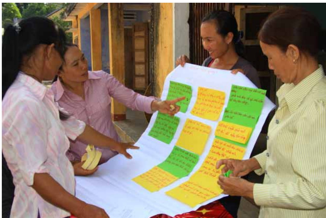
Women take part in a planning exercise in Viet Nam to identify suitable livelihoods activities for community groups.

With RFLP support and advocacy, the Sri Lankan government has revised the Fisheries and Aquatic Resources Act No. 2 of 1996 which did not allow women to be members of Fisheries Committees. This represents an unprecedented opportunity for women to become legal members of Fisheries Committees and to participate in fisheries planning and management.