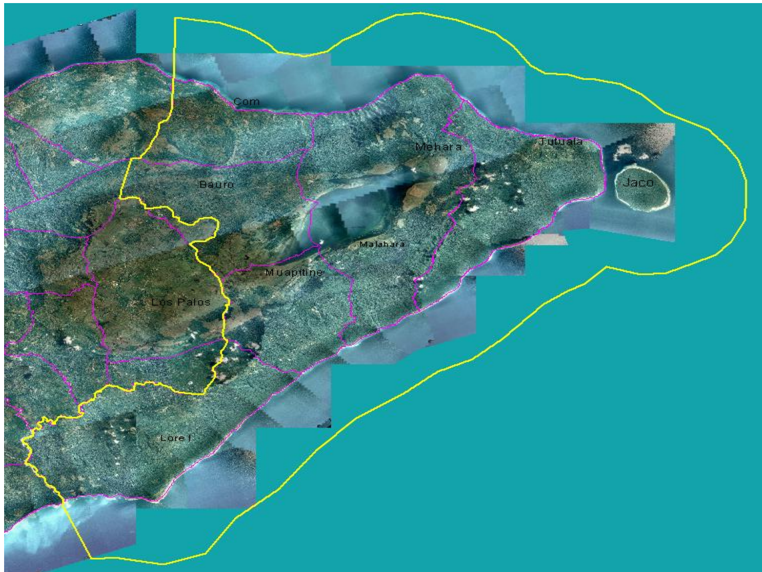
Figure 3. Aerial photographic view of the Nino Conis Santana National Park land and marine boundary, 3 nautical miles from the coast.