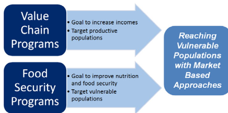
Figure 1: Previous program design (split goals) versus current program design

Improved food production and market availability do not ensure that nutritionally vulnerable populations will consume more nutritious foods. Households may instead choose to buy more processed, convenient or less-nutritious foods. Furthermore, improvements in post-harvest handling or storage could lead to losses in the nutrient content of crops. While recent years have seen successes in increased agricultural production and improved linkages along the value chain, most agricultural programs have had limited to no impact on reducing malnutrition because they often do not address the underlying determinants of nutritional status, such as the consumption of required micro- and macronutrients, quality