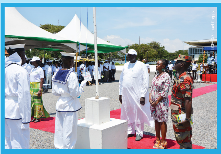
Flag Raising Ceremony at the 2015 World Food Day celebration in Accra, Ghana