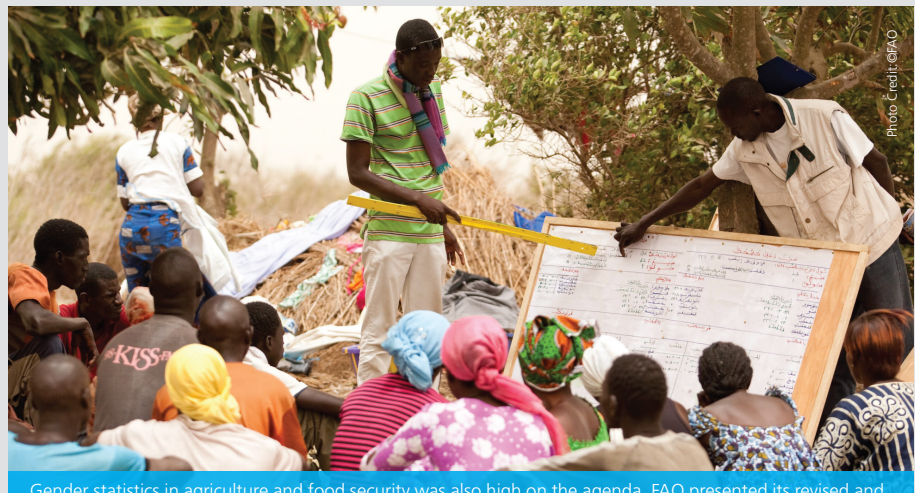
Gender statistics in agriculture and food security was also high on the agenda. FAO presented its revised and published guidelines for agricultural census, the World Programme for Census Agriculture (WCA) to member