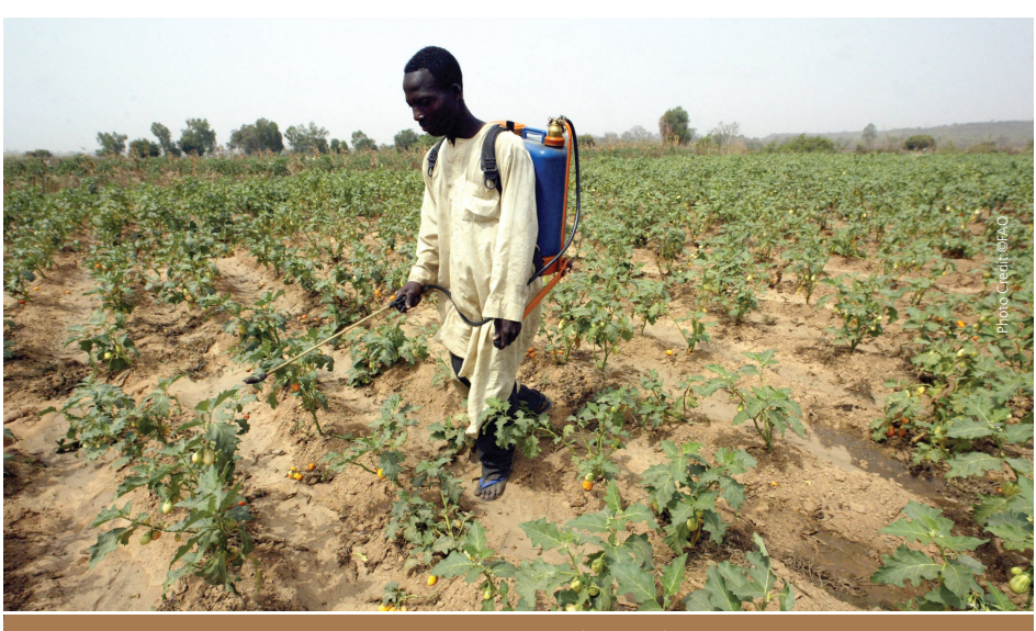
FAO's international work on obsolete pesticides involves identification of obsolete stocks (inventory), safeguarding, disposal and helping countries to prevent further accumulation

In some cases such pesticides have caught fire leading to serious environmental damage and loss of property. Cases of pilferage have been recorded in Zimbabwe and elsewhere from poorly secured obsolete stockpiles,