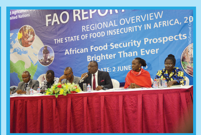
Panel Discussion on the State of Food Insecurity in Africa during the official launch of SOFI 2015