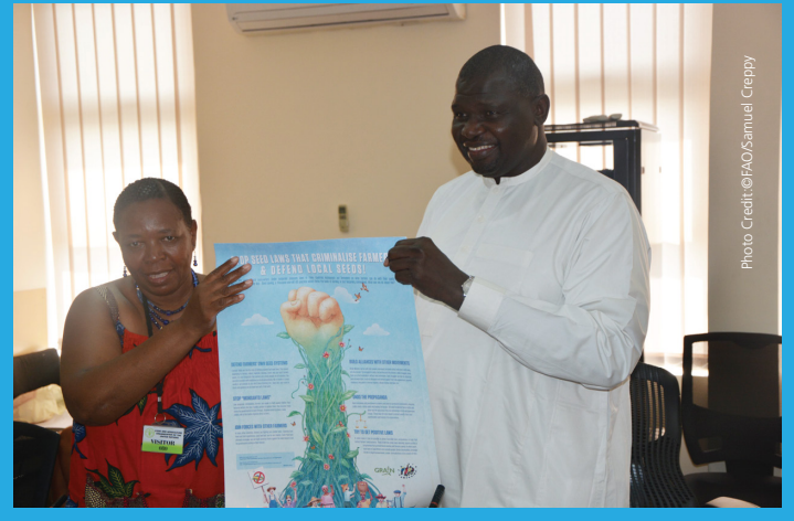
Technical Seminar: Convergences between the FAO Strategic Framework and La Via Campesina Field Activities in Africa

Food and Agriculture Organization of the United Nations, Regional Office for Africa, #2 Gamel Abdul Nasser Road P.O. Box GP 1628 Accra, Ghana, Tel: (+233) 302 610930 Fax: (+233) 302 668427 Email: fao-ro-africa@fao.org