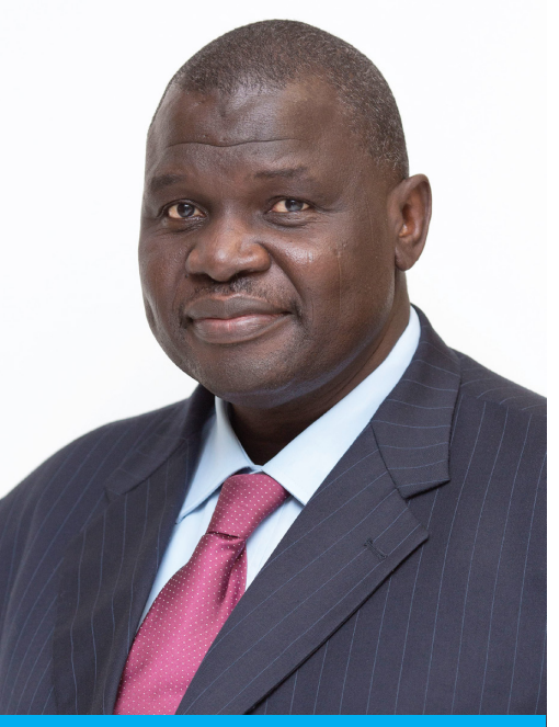
Regional Representative for Africa

Another significant point of achievement for the FAO during the year under review is that countries have been supported with the the campaign for food security and nutrition security, gained much emphasis in 2015 hand in hands – that it is not only just the food quantity that matters but the quality as well, which has to go along with the nutritional qualities of the foods eaten. According to the Assistant Director-General and Regional Representative, FAO with other partners had been echoing that message for quite some time, and in 2014 FAO in partnership with the World Health Organization organized the of the implementation and that those to be International Conference on nutrition "which supported are actually deriving some has been applauded and we are following up on the recommendations". Moving forward