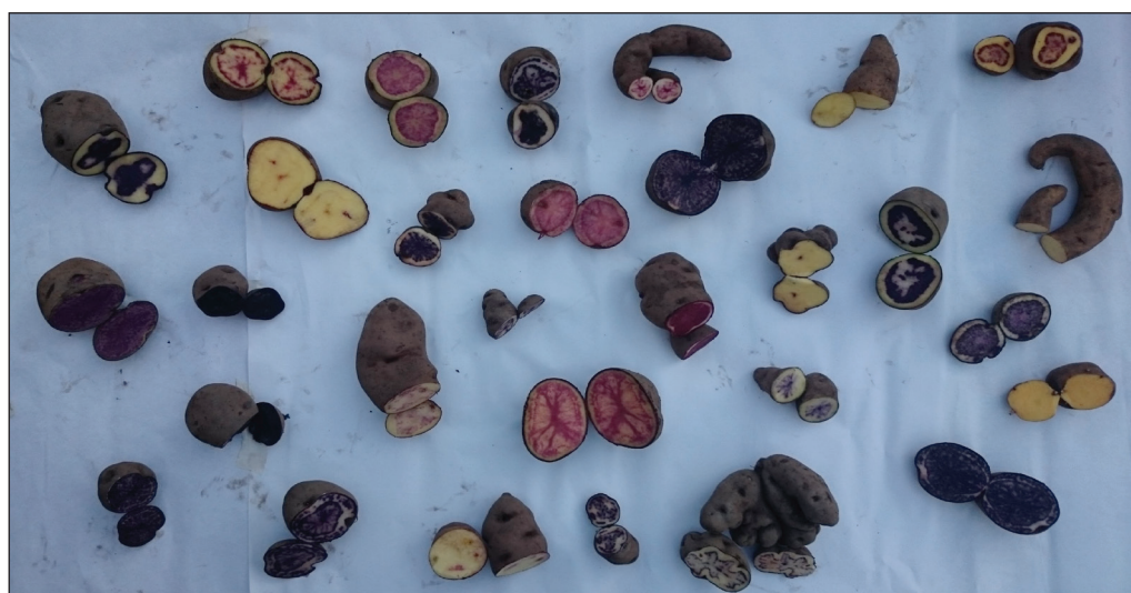
Figure 1: Sample of native potatoes produced in Andahuaylas province