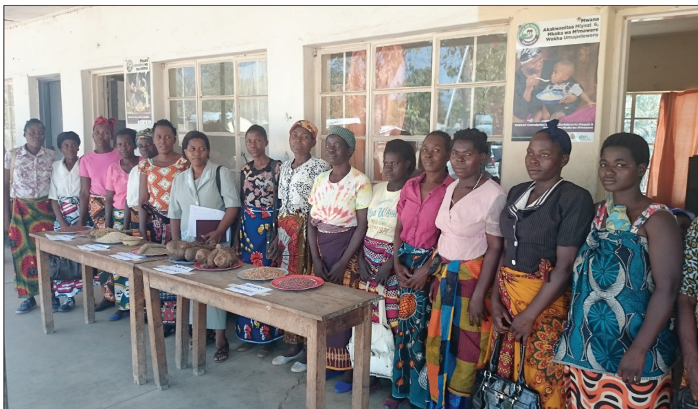
Figure 3: Local varieties of sorghum, millet cowpea and yams tolerant to drought (Salima District)