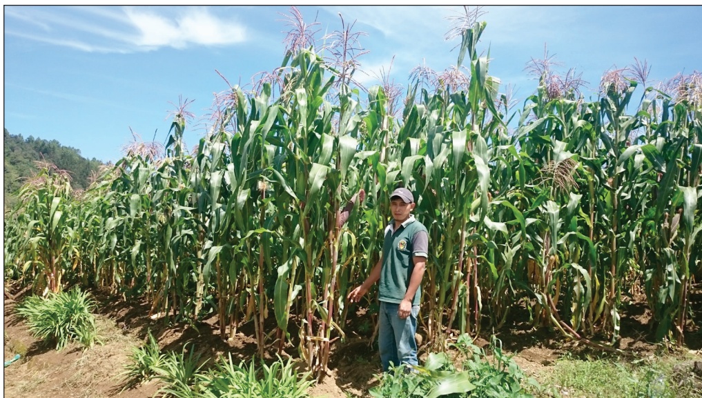
Figure 2: Production of the shorter Breve variety of maize in Solola, Guatemala

produce higher yields of maize and kidney beans in spite of difficult growing conditions in 2014 and 2015. 52 Most significant were farmers in Zacapa who reported that they produced between 50 to 55 quintals/manzana of the White Arruquin maize variety in 2015 and in Solola where farmers had successfully bred a shorter variety of Breve maize through careful seed selection enabling them to produce between 70 and 78 quintals/manzana. Moreover, similar levels of production were projected in 2016 (see figure 2).