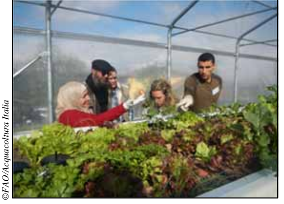
Participants inspecting plants during a plant health practical for signs of insect damage and disease