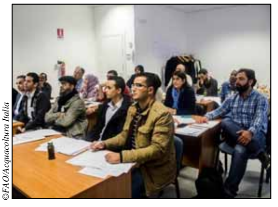
Participants in the classroom during the theoretical portion of the course