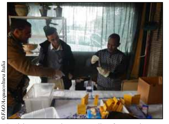
Participants measuring water quality of aquaponic water during practical demonstrations of the nitrogen cycle

Participants examining fish during demonstration of health monitoring and growth measurement