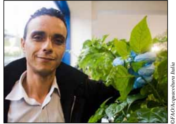
Participant examining the undersides of the leaves of a pepper plant to inspect for insect infestations, and demonstrating the proper use gloves to prevent contamination