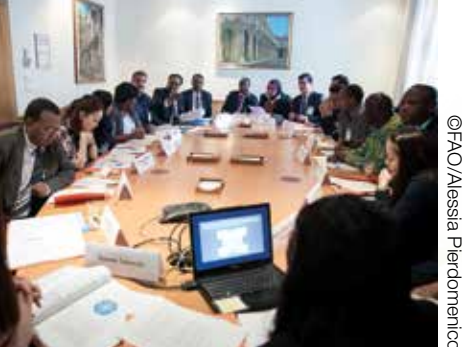
Discussions with experts from developing countries

routine food and environment monitoring for L. monocytogenes together with health surveillance using WGS succeeded in linking apparently sporadic cases over a long time period and the underlying outbreak source was identified and eliminated. In a England , a WGS-based investigation identified the root cause of a Salmonella outbreak and prevented future outbreaks. This case study also highlighted the importance of the availability of WGS data from multiple countries, demonstrating how global sharing of WGS data could enhance the response to international foodborne outbreaks, to further protect public health and identify a particular source of contamination. The experience shared by Kenya showed the potential usefulness of WGS in developing countries, however having WGS data in itself was not sufficient and there was a need identified for a significant amount of advocacy and understanding of both advantages and possible disadvantages of using the technology in countries with limited capacity and resources.