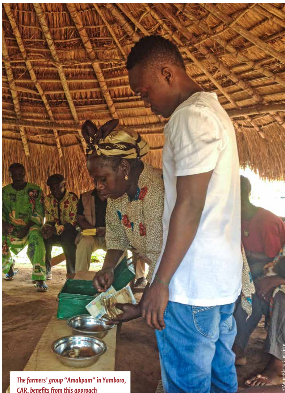
The farmers' group "Amakpam" in Yamboro, CAR, benefits from this approach