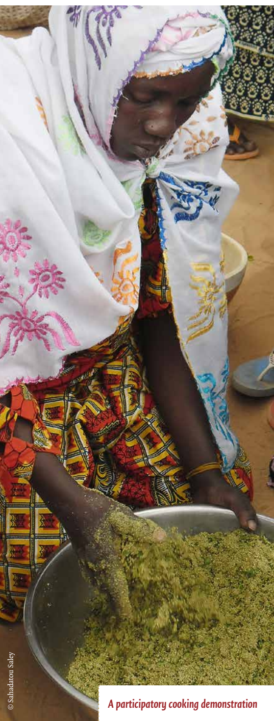
A participatory cooking demonstration

As part of the joint Rural Women Economic Empowerment (RWEE) programme, FAO has launched an initiative for nutritional education in the Dosso region. Various sessions organized between 2015 and 2016 by NGO Kundji Fondo were planned using a participatory approach, with support from the Dimitra Clubs. Some interesting behaviour changes have been observed.