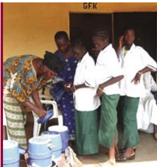
School children buying yoghurt at the dairy plant

there is a high prevalence of immuno deficient (HIV/AIDS) diseases and in aged populations e.g. fighting osteoporosis.