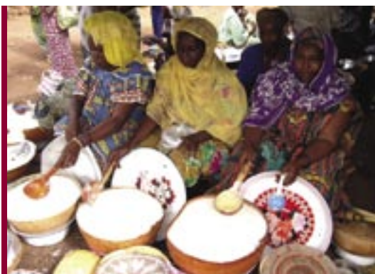
Women selling milk on the local market