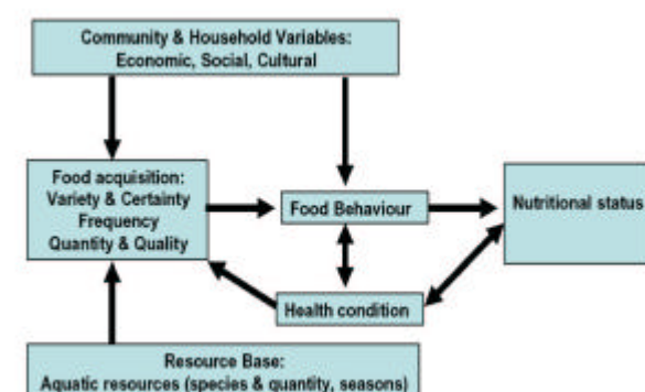
Figure 1. Linking aquatic resources to nutritional status

‘Nutritional status’ is the result of the interaction of a number of variables, which are shown in Figure 1. This conceptual framework was used as the basis for understanding the links between health and nutrition and aquatic resources. In this framework, the aquatic resource base is the source from which food is acquired and is expressed in terms of variety and certainty of acquisition, frequency, quantity and quality.