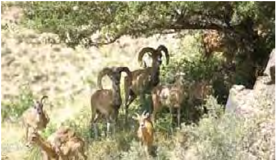
The Servertov's argali, the smallest argali subspecies occurs in the hottest part of the argali range area. The need for shelter makes them vulnerable to deforestation and competition with livestock.

Rehabilitation and sustainable use of wild ungulate populations can provide a land-use option which avoids land degradation often caused by intensive livestock grazing and tillage. Wild ungulates are much better adapted to the ecosystems than domestic livestock. Their important ecosystem functions include the spreading of the seeds of plant species over wide areas the redistribution of nutrients through their manure.