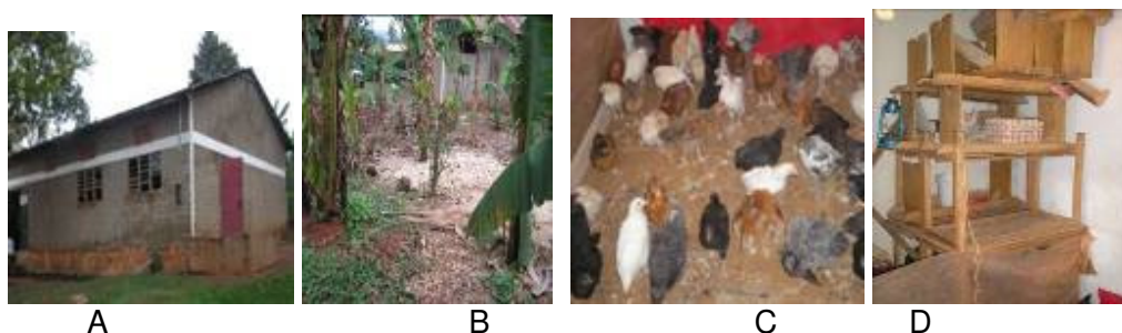
Fig.2.2. Showing biosecurity status in the commercial local chicken hatchery: Hatchery building (A), hatch shell debris disposed next to the hatchery (B), two month old birds on the soiled floor at the back stage of the egg store/chick dispatch office (C) and eggs and other office furniture (D) at the ULCFA headquarters depot.

Should eggs from one farmer be heavily contaminated and the decontamination before setting at the hatchery is inadequate, a breach in biosecurity will occur. Any infection associated with the eggs, hatchery or brought about by workers will now be spread to all farms where the day old chicks will be distributed. Such infections will be a danger to flocks already at the farms. Avian influenza could be spread easily through such a distribution network in the event of inadvertent entry into some point in the network. In addition, we found two month old growers kept at the association's office in the same store where eggs were being received and the day old chicks were distributed from (Fig.2.2C). There was no segregation of clean and dirty operations in relation to DOCs, hatching eggs, maturing birds and other office equipments (Fig.2.2D). However, the DOCs in the cartons were looking bright and clean.