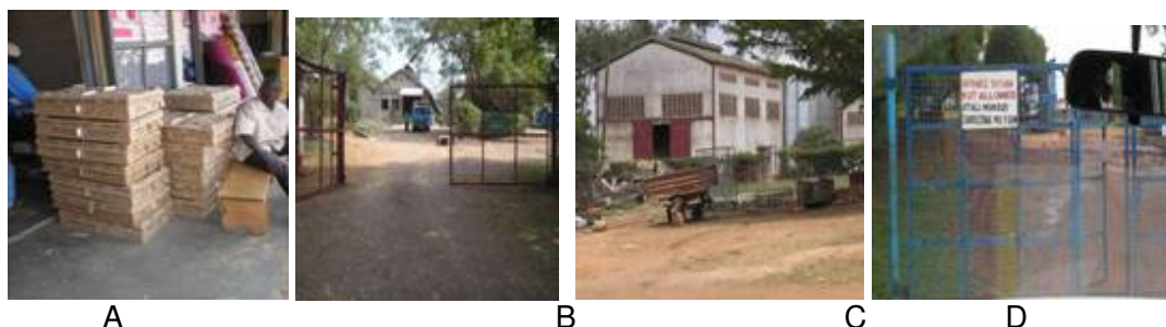
Fig 2.1. Showing biosecurity in commercial hatcheries: DOCs cartons on veranda (A), Hatchery gates wide open (B), and dusty feed mill (C) in one hatchery; closed gate and signage at the other hatchery (D).

Although the two commercial hatcheries visited (Ugachick and Biyinzika) had very good biosecurity arrangements, there were some biosecurity issues they could watch. Ugachick have sales offices far too close to the flocks and the hatchery and there is no sanitation facility up to this level for visitors. Feed trucks didn't seem to have been decontaminated although a hand spray pump was there at the entrance. The gates to the breeding farms and the office blocks remained open for far too long (Fig.2.1B). However, good sanitary facilities exist at the flock houses and the entrances to buildings just behind the office blocks. The sales office premises could be relocated nearer the entrance. In addition, they have a feed mill (Fig.2.1C). and a repair workshop so dust and other aerosols find their way into the washing up area for the hatchery. These are structural biosecurity issues which cannot be easily resolved by recommending changes, should an avian influenza outbreak occur. In this case, the hatchery can only rely on stringently observing operational biosecurity measures.