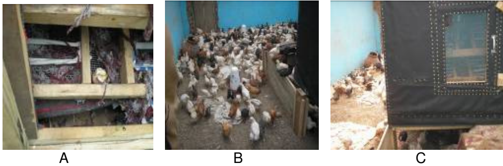
Fig. 2.3 Showing hatching of indigenous chicken in a locally made incubator : Clothing, wooden frames and egg shells (A), brooding chicken (B) and incubator exterior (C).