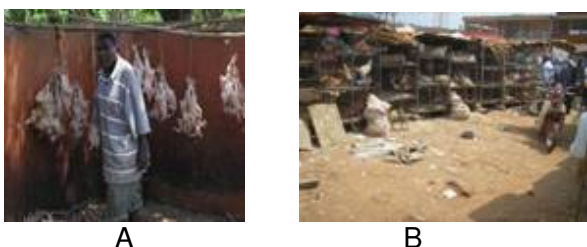
Fig.7.1. Showing trade and marketing: Broiler chicken slaughtering at Namawojolo (A); A live bird market with stacked cages and a lot of clutter where there was no cleaning done at all (B).

Major bio-security concerns arise at the slaughtering stage where birds seem to have been slaughtered all at once and left on the floor to be defeathered by dry plucking at owners’ pleasure; the water to wash the birds needed to be changed more often and looked definitely soiled. The feathers were disposed some distance away from the slaughter slab together with the waste water. However, it was not clear how the heads and offals were, disposed off. The slaughter slab has a smooth floor which was easily cleanable and perimeter wall is good as well as the waste water drainage channel. However, the carcass dressing table was rough and needs some repairs. None of the persons processing the birds had any special protective clothing. They could easily transfer infection from the slaughter slab to local indigenous chickens at the home villages. One bicycle used to bring broilers for sale to the market was still packed at the slaughter slab with one live broiler inside the plastic carrying cage. It was covered with caked bird droppings all over inside and outside and if others were likewise, then biosecurity issues during transportation are of much concern.