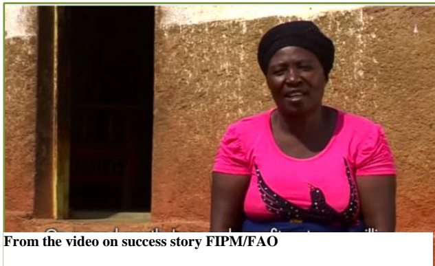
From the video on success story FIPM/FAO