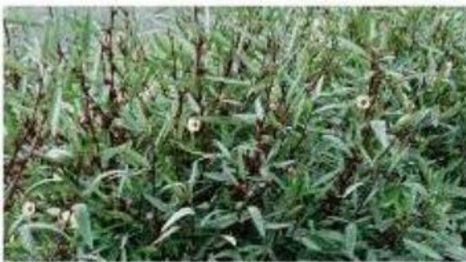
Figure 3: Hibiscus plantation 12

Demand has steadily increased for roselle over the past decades. Currently approximately 15,000 metric tons enter international trade each year. 3 Many countries produce roselle but the quality markedly differs. China and Thailand are the largest producers and control much of the world supply. Thailand invested heavily in roselle production and their product is of superior quality, whereas China's product, with less stringent quality control practices, is less reliable and reputable. The world's best roselle comes from the Sudan, but the quantity is low and poor processing hampers quality. Virtually all of Sudan's production is exported to Germany. US importers also prefer the Sudanese product, but due to a trade embargo, importers there are forced to source this product through Germany at a considerable mark-up in price. As such, the Sudanese product is used much less in the US, and China and Thailand are the main suppliers. Mexico, Egypt, Senegal, Tanzania, Mali and Jamaica are also important suppliers but production is mostly used domestically.