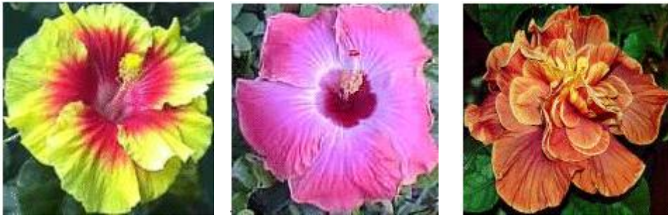
Figure 2: Hibiscus flowers 11