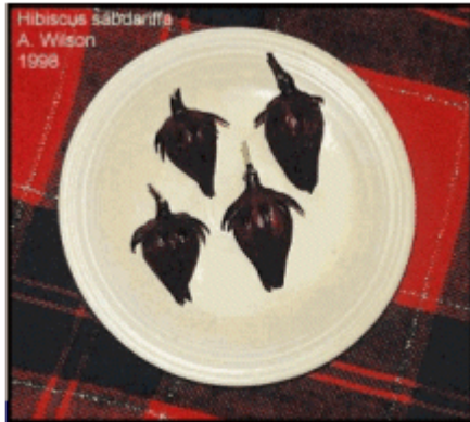
Figure 4: Hibiscus calyces 13

The young leaves and tender stems of roselle are eaten raw in salads or cooked as greens alone or in combination with other vegetables or with meat or fish. They are also added to curries as seasoning. The leaves of green roselle are marketed in large quantities in Dakar, West Africa. The juice of the boiled and strained leaves and stems is utilized for the same purposes as the juice extracted from the calyces. The herbage is apparently mostly utilized in the fresh state though it can be evaporated and compressed for export from the Philippines.