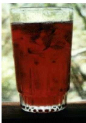
Figure 5: Hibiscus juice 14