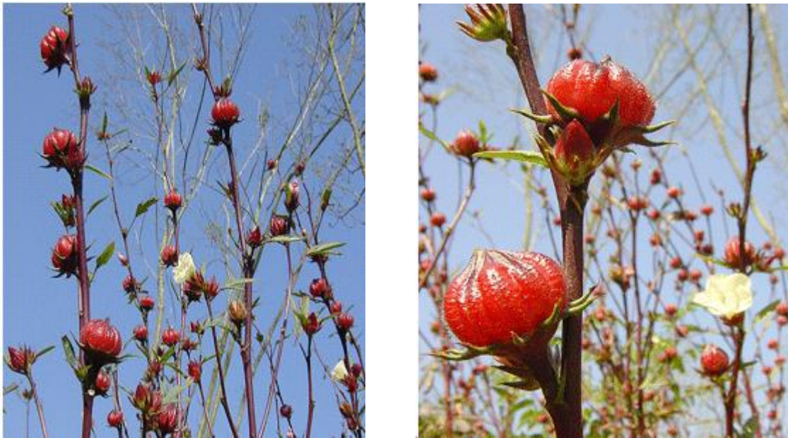
Figure 1: Hibiscus plants ( Hibiscus sabdariffa ) 10

Hibiscus sabdariffa var. sabdariffa , commonly known as hibiscus or roselle, grows in many tropical and sub-tropical countries and is one of highest volume specialty botanical products in international commerce. Roselle is an annual herbaceous shrub of the Malvaceae family. The leaves are used extensively for animal fodder and fiber, but the swollen calyces are the plant part of commercial interest. As the flowers fall off, the bright red calyces swell. These are harvested by hand, dried, and sold whole into the herbal tea and beverage industry. The flavor is a combination of sweet and tart, similar to cranberry. In addition to international markets, there are extensive local and regional markets as well where it is processed into hot and cold herbal beverages, jellies, confectionaries and other products.