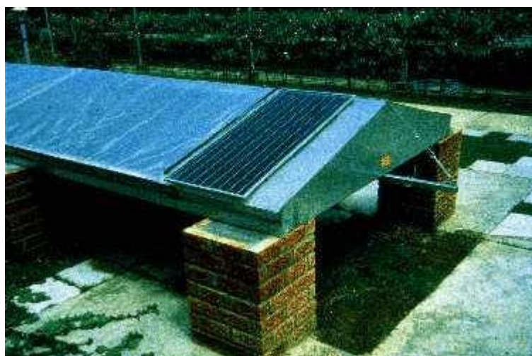
Figure 6: Solar drying tunnel 15

But often color, texture and flavor of these calyces are not up to standard, neither of the internal consumers nor of the international market. An improvement of product quality can be achieved by using more adequate methods. Hot air dryers as used in developed countries are rather expensive but for instance the "Solar drying tunnel" provides a cost-efficient alternative.