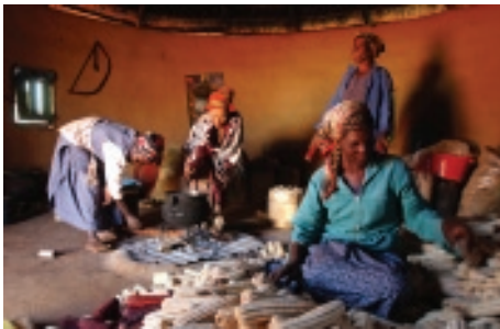
Sorting maize seed.

of forest fires caused by human activities, mainly routine agricultural tasks conducted by women, such as burning of orchard refuse. The project trained villagers to develop better watershed and land-use management techniques, like water harvesting and maintenance of fire breaks. Villagers also learned to produce organic fertilizer to replenish the soil by making compost out of small branches, twigs and bio-degradable plants and fibres. The project also trained villagers in the collection, storage and marketing of non-wood forest products like mushrooms and aromatic plants.