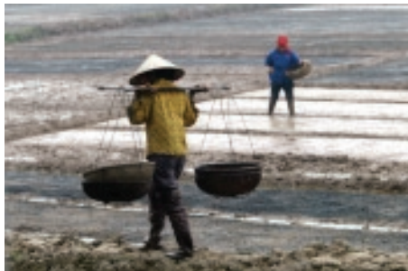
Working in the rice paddy.