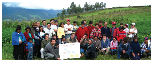
Members of the Plataforma in Chimborazo in 2004.

This study was funded by the FAO-Netherlands Partnership Program (FNPP) and the FAO Norway Partnership Program (FNOP).