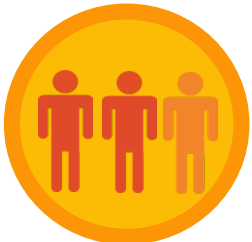
Two-thirds of the world's youth live in poverty

The ICA programme supports countries in adopting and implementing youth-inclusive and employment-centred agri-food system development policies, strategies and programmes.