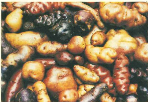
... Solanum spp.