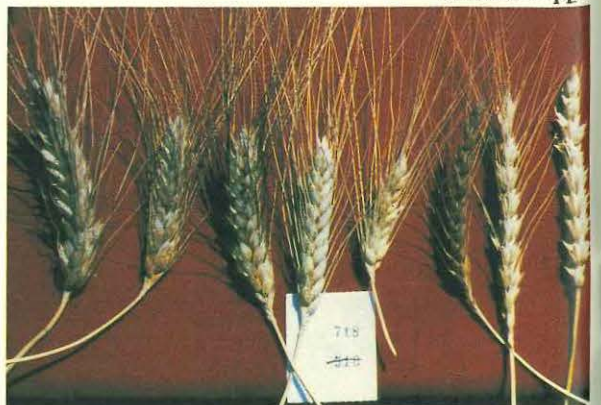
... Triticum spp.