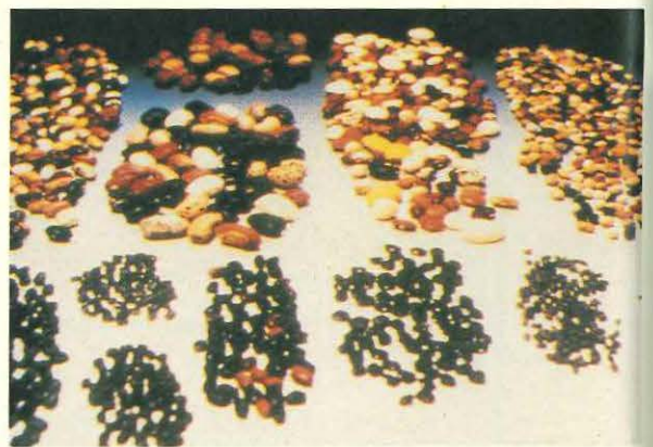
... Phaseolus spp.