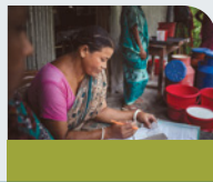
Agricultural integrated survey programme (AGRISurvey)