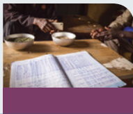
Census of agriculture