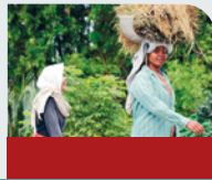
Food security and nutrition statistics