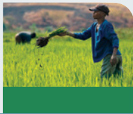
Crops, livestock and food statistics