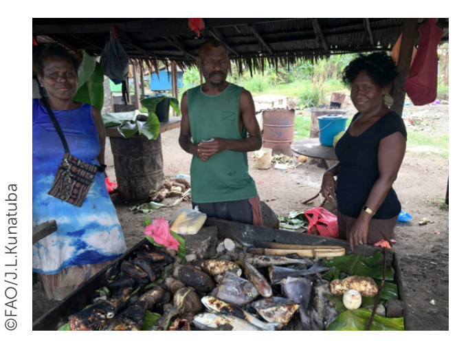
Roadside food stalls in Honiara.

Discussions with participants at the Assessment validation workshop (see Annex 4) revealed that rural women play an important role in agricultural products value addition, some obtaining the greatest portions of their incomes from this activity. According to the 2012/13 HIES, foods processed at home for sale contributed SBD 135 600 (approximately USD 16 028) a year to gross household income from subsistence activities (National Statistics Office, 2015). This income was higher than incomes from sales of both betel nut and handicrafts. Sale of food in rural markets and roadsides is common, with ready made meals of fried reef fish with cooked yams or bananas. Validation workshop participants added that rural women often sell their crops to intermediaries in Honiara, who in turn add value to the agricultural produce to sell in roadside markets.