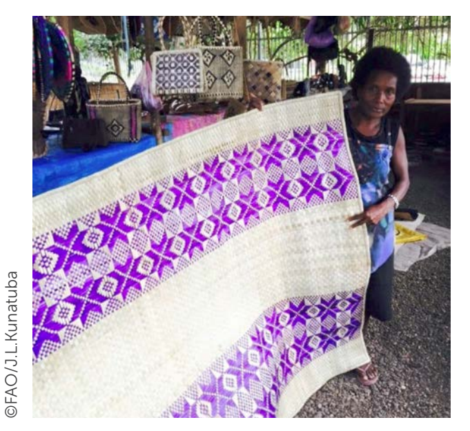
Artisan from Morovo holding up one of her creations

, Social Development Programme Photo Library